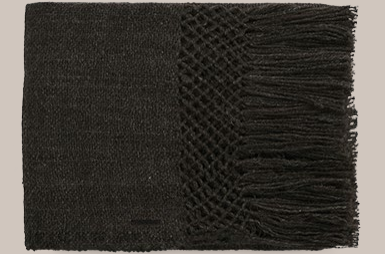
Natural Grey HWL2T