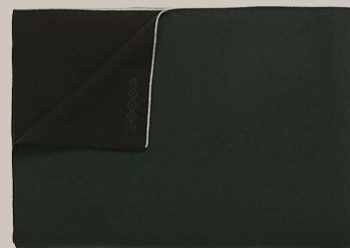
Racing Green CMW2T