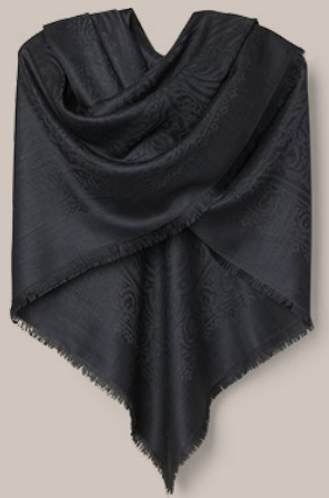
Prussian Blue SAP3S