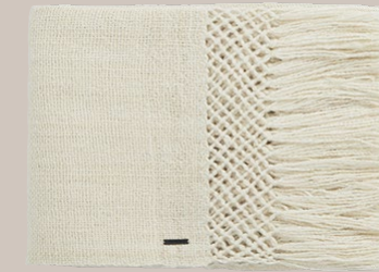
Natural Cream HWL1T

These exceptional Llama throws are meticulously handcrafted in northern Argentina from locally sourced fibres. The Llamas are not shorn until they are three years old. One fleece from one animal each year creates just one throw. Each is completely natural and undyed so totally unique.