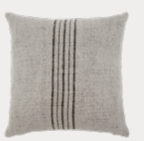
Fox Cushion with Vertical Detail: Dawn (FX1C45)