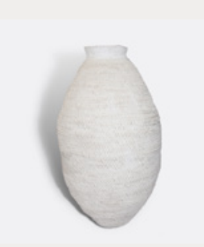
Buhera Basket XL: White (BUH7) W60cm x H112cm