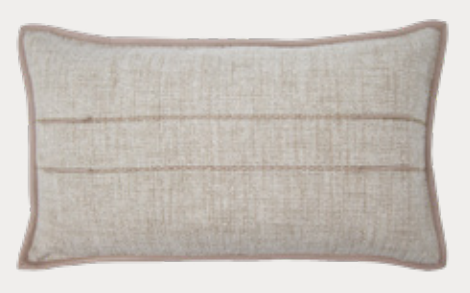
Hoxton Cushion with Leather detail: Flax (HOX2C60) Also available in Oat