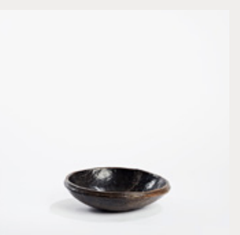
Lozi Bowl: Dark Brown (LOZB1) W40cm