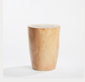
Kettle Table Medium: Natural