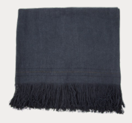
Fox Throw with Fringe and Leather Detail: Night (FX7T) W140cm x L210cm