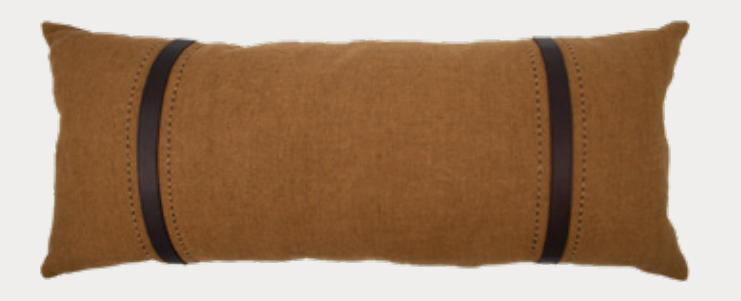
Bracken Sofa cushion with leather straps: Clay (BRA6C90)