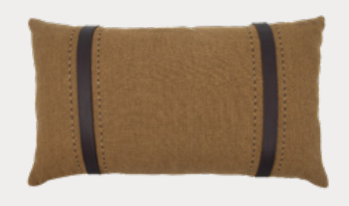
Bracken cushion with leather straps: Clay (BRA6C60)