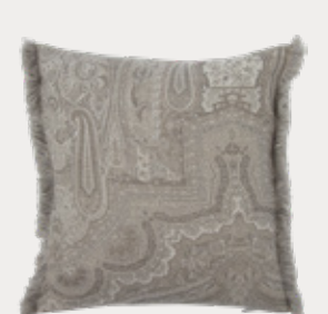
Victoria Cushion with fringe: Crystal (VIC1C)