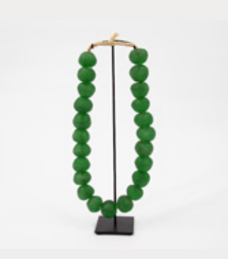
Recycled Glass Beads Extra Large: Green (BEAD2) 42cm