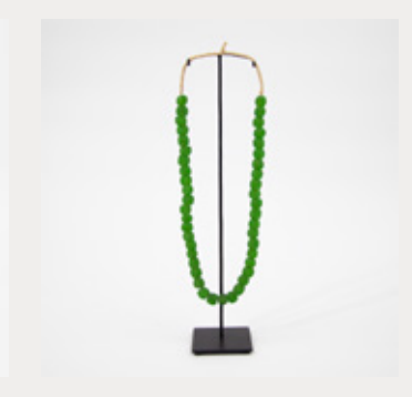
Recycled Glass Beads Medium: Green (BEAD4) 35cm