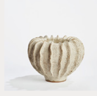
Reef Ceramic Vase Large: White (VAS3) W48cm x H34cm