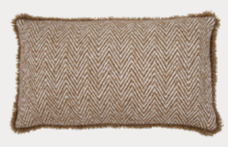
Spitfire Cushion with fringe: Canyon (SPT5C)