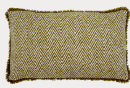
Spitfire Cushion with Fringe: Amazon (SPT6C)