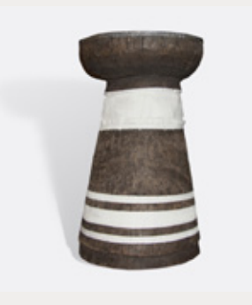
Lozi Mortar with Metal Top: White Stripe (LOZM1) W32cm x H55cm