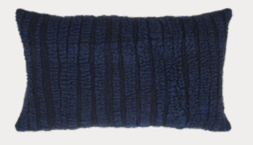
Felted Bark Cloth and Linen Cushion: Indigo/Black (FLBL1C)