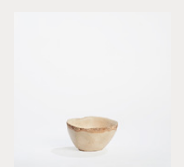
Jacaranda Wooden Bowl: Natural (WBN1) W25cm