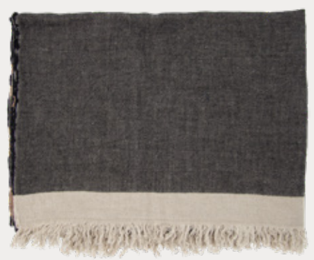
Belgian Linen Towel: Black Stripe (LTOW1) W110cm x L180cm