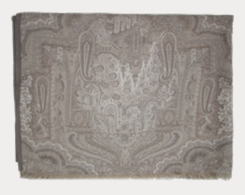
Victoria Throw with Fringe and Suede Edge: Crystal (VIC1T) W140cm x L240cm