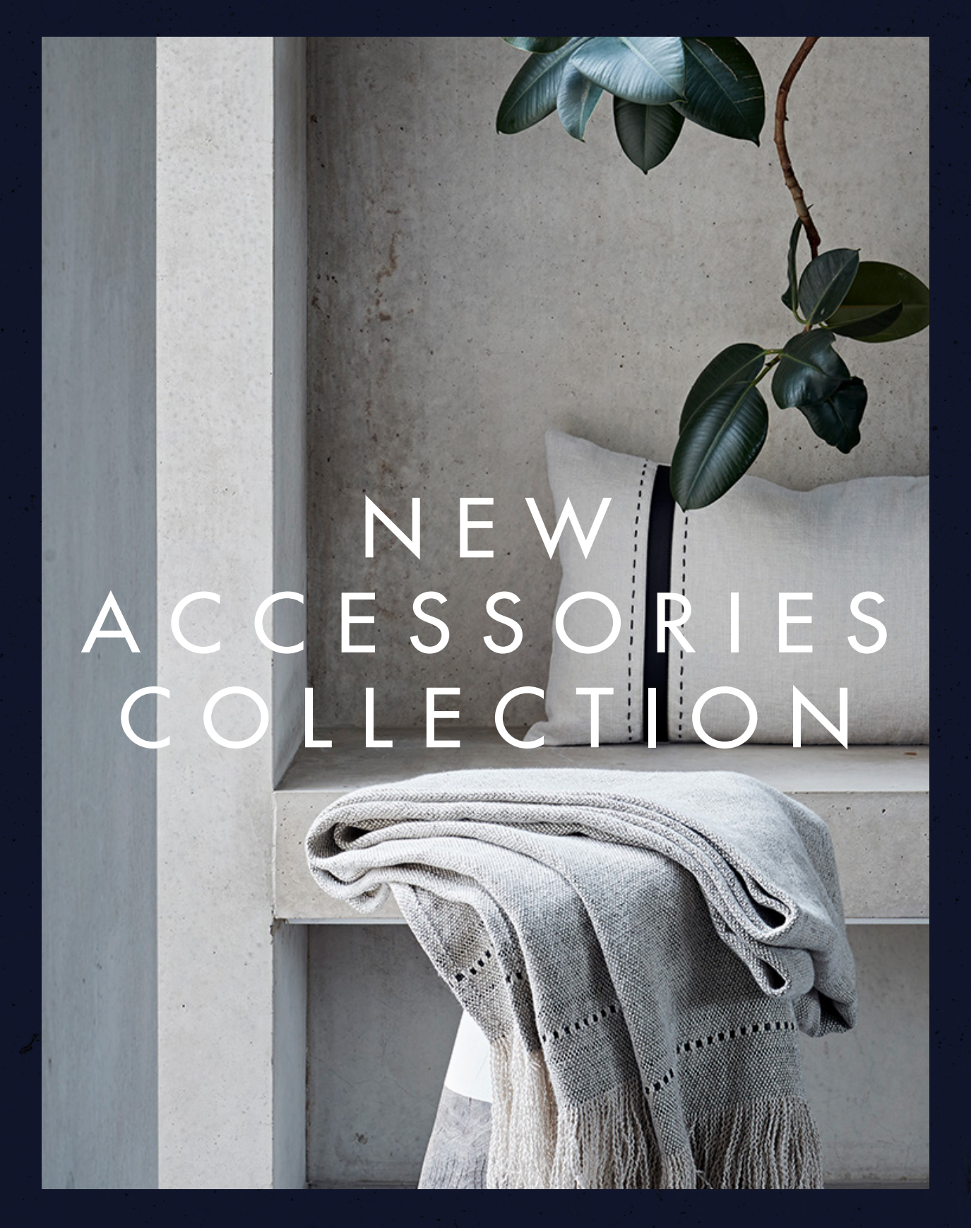
de Le Cuona