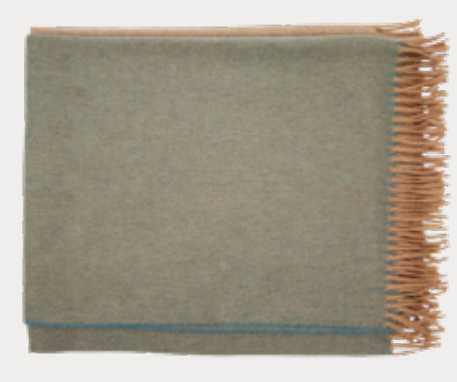
Cashmere Throw: Green/Camel (TCA2T) W140cm x L180cm