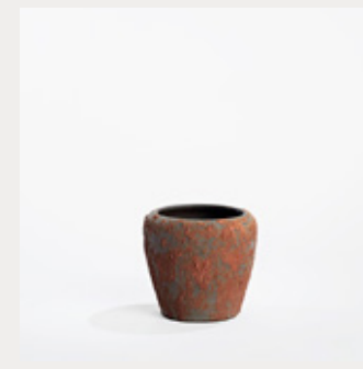
Terracotta Vase Large: Brown Lava (BRL2) W29cm x H26cm