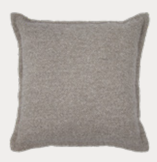
Linen and Wool Boucle Cushion: Taupe (LWB1C)