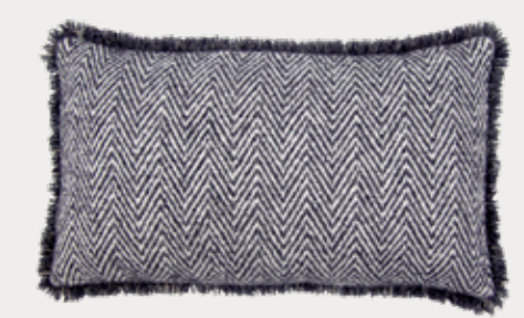
Spitfire Cushion with Fringe: Island (SPT9C)