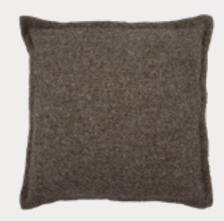
Linen and Wool Boucle Cushion: Brown (LWB2C)