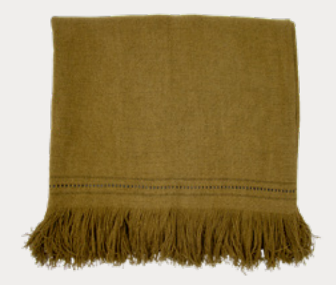
Fox Throw with Fringe and leather detail: Reed (FX4T) W140cm x L210cm