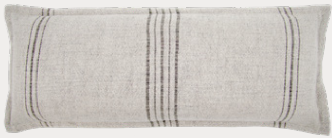
Fox Sofa Cushion with Vertical Detail: Dawn (FX1C90)