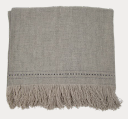
Fox Throw with Fringe and Leather Detail: Dawn (FX1T) W140cm x L210cm