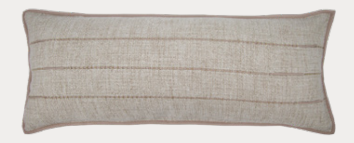
Hoxton Sofa Cushion with Leather detail: Flax (HOX2C90) Also available in Rye