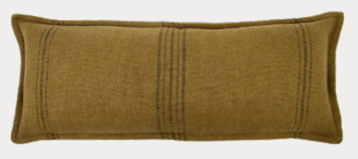
Fox Sofa Cushion with Vertical Detail: Reed (FX4C90)