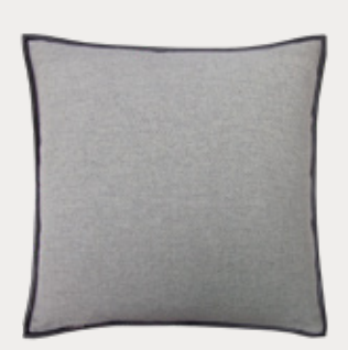
Cashmere Wool Twill Cushion with Leather Trim: Light Grey (CWT2C)