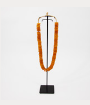
African Amber Beads Medium: Orange (BEAD1) 35cm