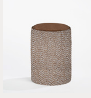
Spitfire and Bracken Pill Stool: Canyon/Clay (PSTO3) Available in size 35 and 40