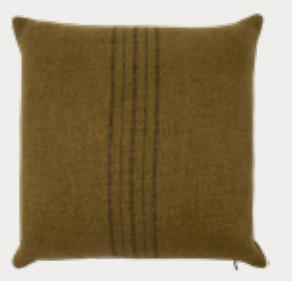
Fox Cushion with Vertical Detail: Reed (FX4C45)