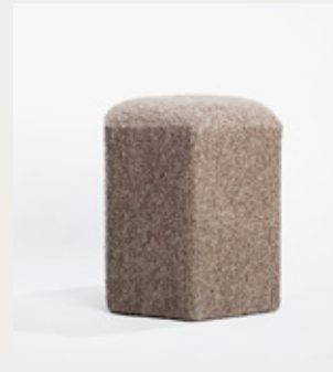
Linen and Wool Boucle Hexagonal Pill Stool: Brown (PSTO1) W45cm x H45cm