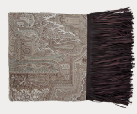
Victoria Throw with Leather Tassels: Moondust (VIC2TT) W140cm x L220cm