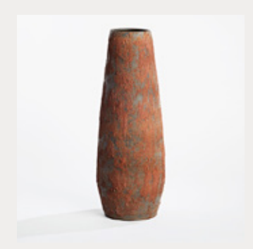
Terracotta Vase Extra Large: Brown Lava (BRL3) W25cm x H70cm