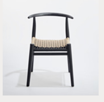
Nguni Dining Chair: Black and Canvas (NGU3) D55cm x H77cm x W55cm