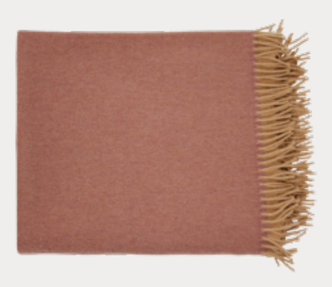
Cashmere Throw: Pink/Camel (TCA1T) W140cm x L180cm