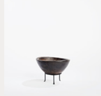
Hausa Wooden Bowl Small: Brown (SHAU1) W30cm x H15cm