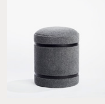
Russian Winter Pill Stool with Leather Detail: Sable (PSTO5) W43cm x H43cm