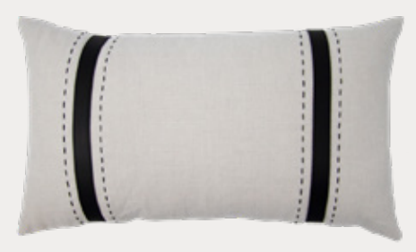
Bracken Cushion with Leather Straps: Mushroom (BRA3C60)