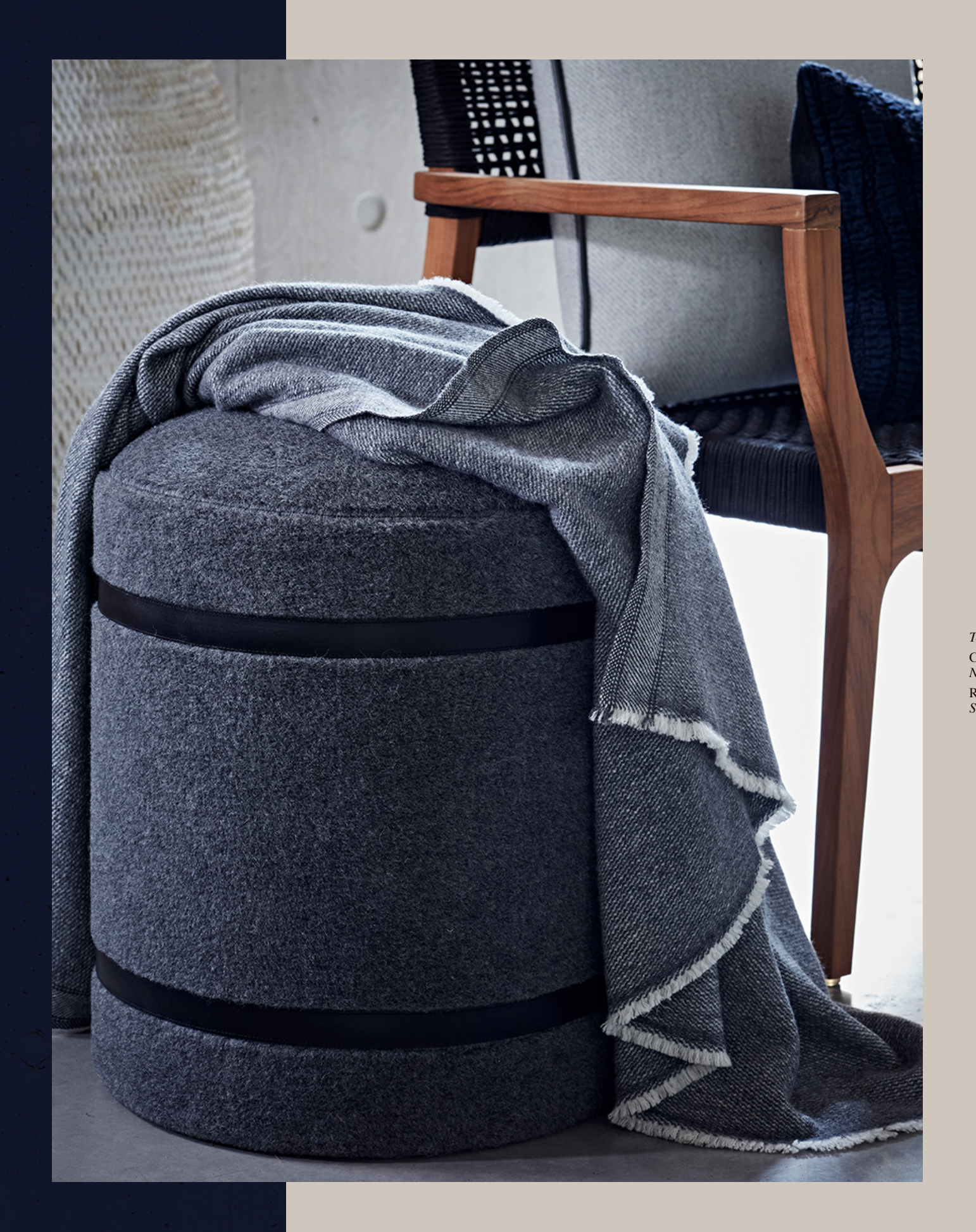
Top to Bottom Cashmere Throw with Border: Natural/Grey Russian Winter Pill Stool with Leather Detail: Sable