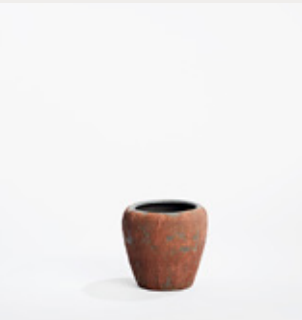
Terracotta Vase Medium: Brown Lava (BRL1) H24cm x W22cm