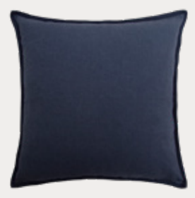
Artist Canvas Cushion with Suede Trim: Night (ART7C)