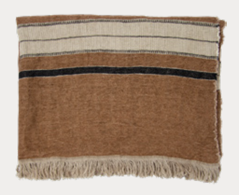
Belgian Linen Towel: Clay Stripe (LTOW11) W110cm x L180cm