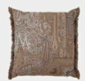
Victoria Cushion with Fringe: Antique Gold (VIC3C)