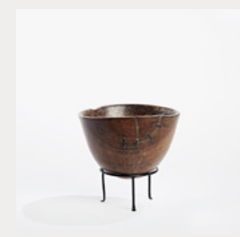
Hausa Wooden Bowl large: Brown (LHAU1) W40cm x H27cm