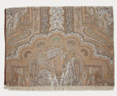
Victoria Throw with Fringe and Suede Edge: Antique Gold (VIC3T) W140cm x L240cm