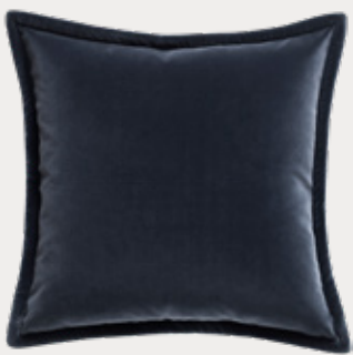
Vienna sofa Cushion: Cha Cha (VIE7C55)