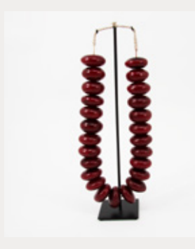
African Amber Beads Large: Maroon (BEAD3) 42cm