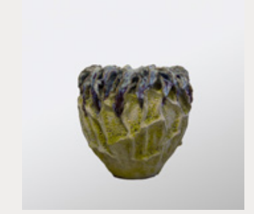
Vine Ceramic Vase: Yellow/Silver (VAS8) H26cm x W25cm