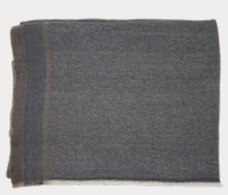
Cashmere Throw with border: Natural/Grey (CASB1T) W140cm x L200cm