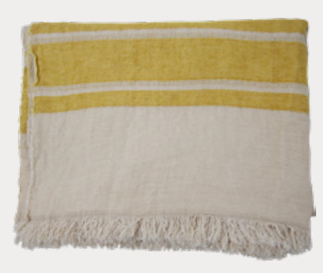
Belgian Linen Towel: Yellow Stripe (LTOW10) W110cm x L180cm