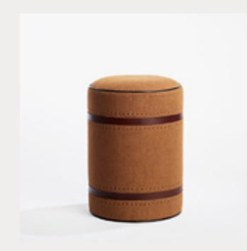
Bracken Pill Stool with Leather Detail: Clay (PSTO4) W36cm x H47cm