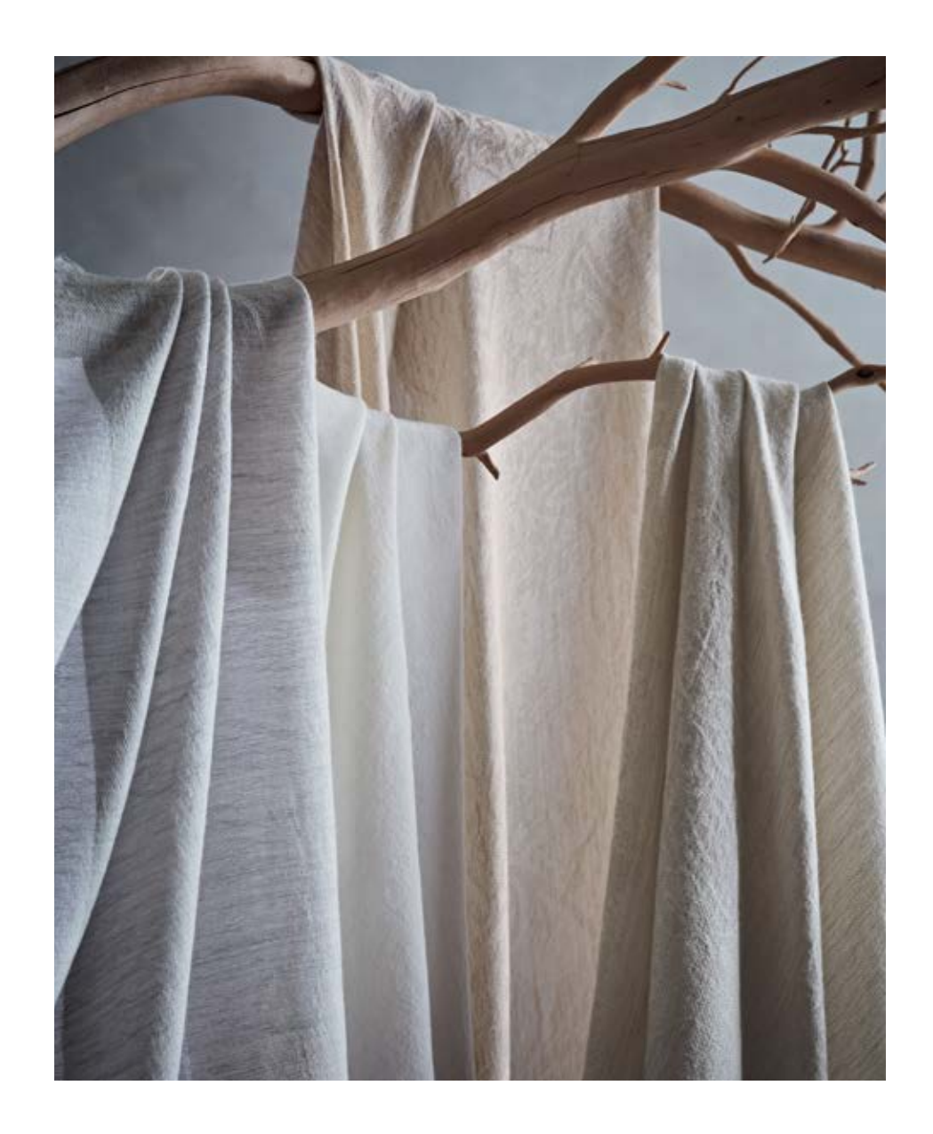
PENCIL SKETCH A pure wool sheer with shadows of damask inspired by 18th century Italian lampas. Cloud, Sand, Pebble, Sky