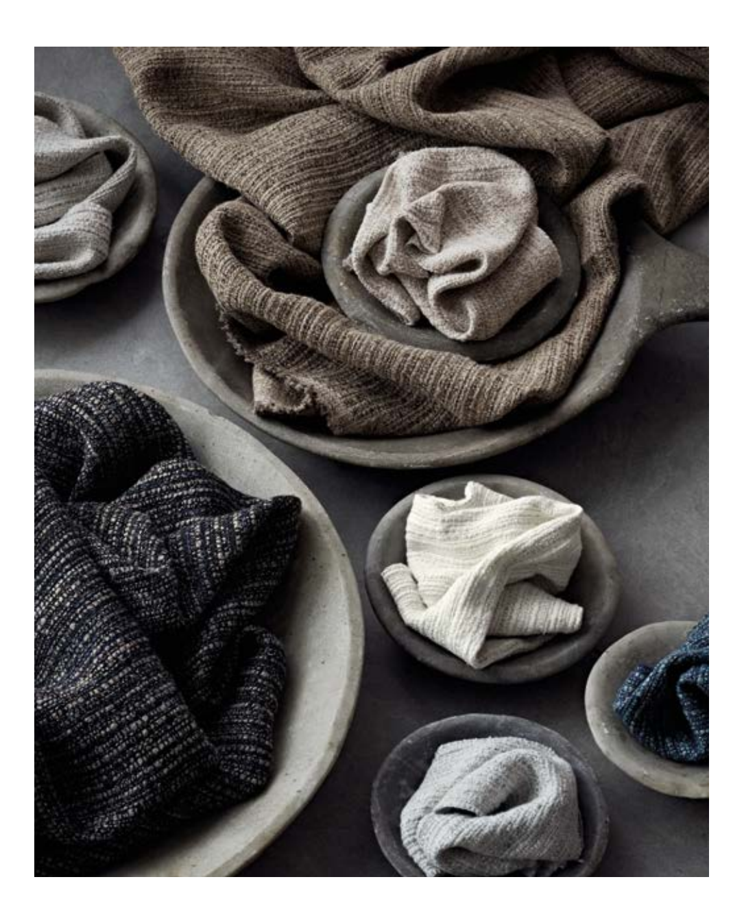
SHORE Yarns in varied thicknesses give a rippled surface and depth to this distinctive, versatile linen. Sand, Dune, Spray, Pebble, Cave, Reef and Rockpool