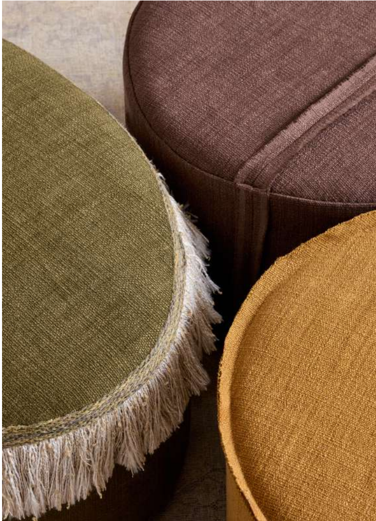
ABOVE & RIGHT