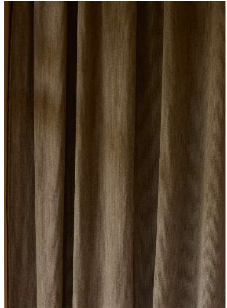
ABOVE & LEFT Curtain: Salopette Teal SAL1