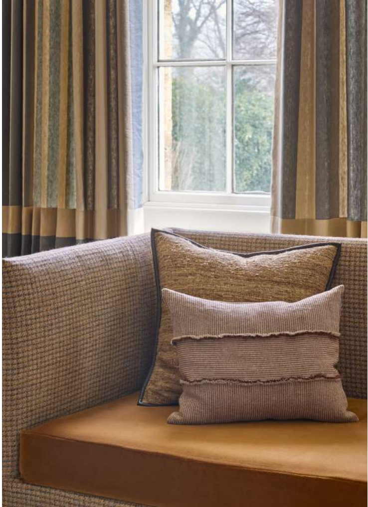
ABOVE Cushion Front: Salopette Maroon SAL3, Sofa Upholstery Arm & Back: Hackney Tweed Prussian Blue HACK3, Sofa Seat Cushion: Vienna Velvet Hula VIE15