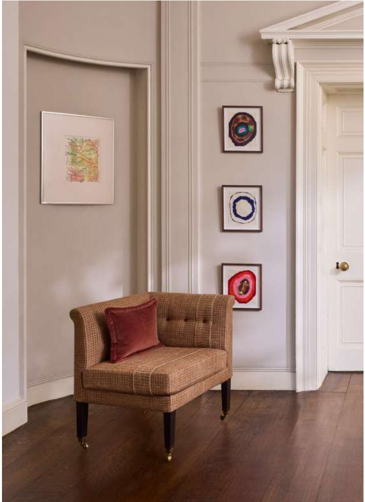
ABOVE & LEFT Chair Upholstery: Hackney Tweed Sienna HACK4, Cushion: Vienna Velvet Bolero VIE14