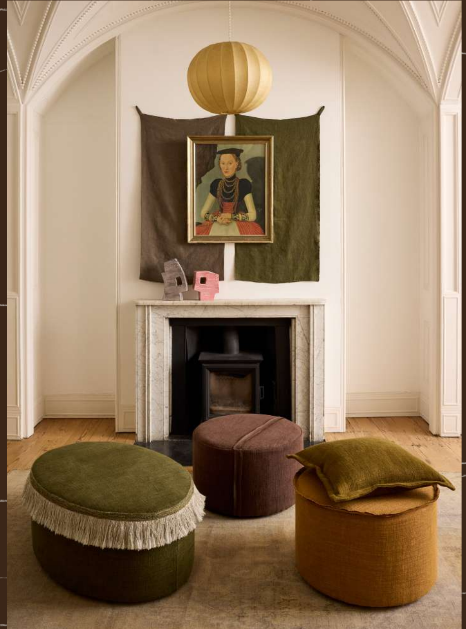
Cushion: Merchant Zaatar MERC2, Wall Hangings: Chukka Donkey CHU5, Chukka Lizzard CHU6