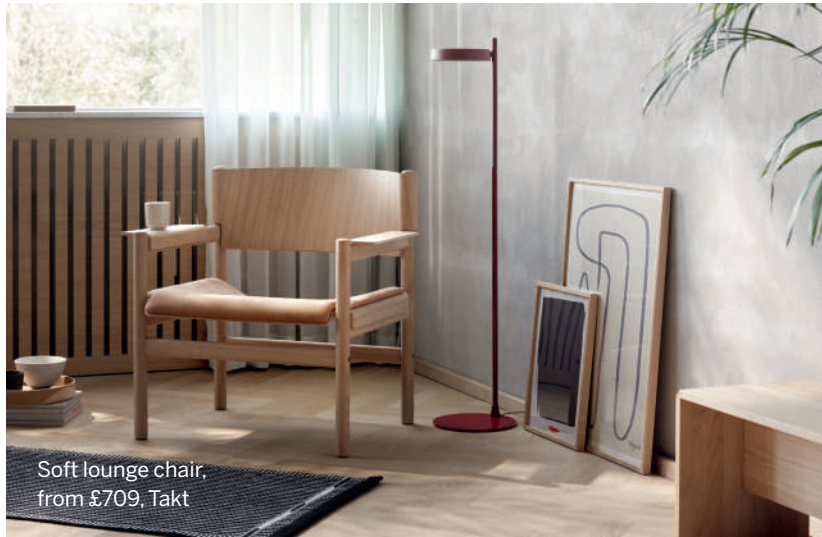
Soft lounge chair, from £709, Takt