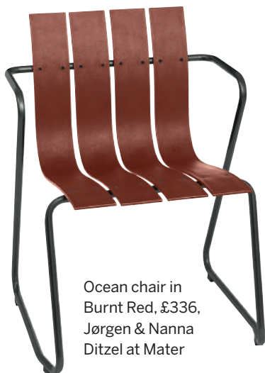
Ocean chair in Burnt Red, £336, Jørgen & Nanna Ditzel at Mater

The Danish design brand Mater has been centred on circular values since its beginnings nearly two decades ago. Creating furniture from recycled materials, such as coffee waste, discarded beer kegs and ocean plastic, it stays true to its Scandinavian design aesthetic while innovating with these unorthodox resources. Through offering a takeback scheme, the brand is taking responsibility for products at the end of their first life. materdesign.com