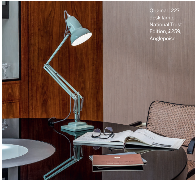
Original 1227 desk lamp, National Trust Edition, £259, Anglepoise

FEATURE: RODDY CLARKE PHOTOGRAPHS (MAIN); ANDERS GRAMER; (ANGLEPOISE) TARAN WILKHU