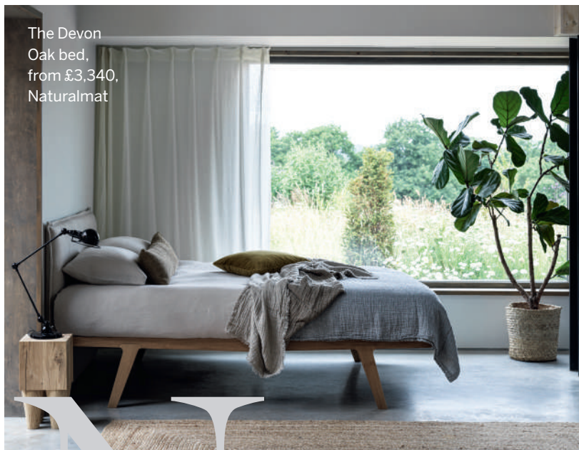
The Devon Oak bed, from £3,340, Naturalmat