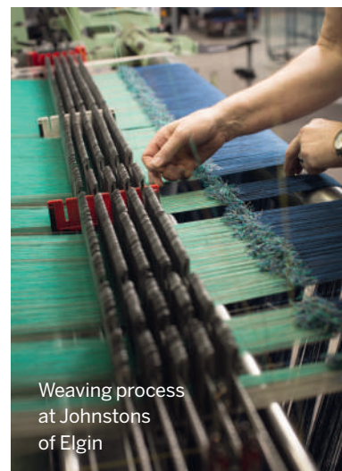
Weaving process at Johnstons of Elgin