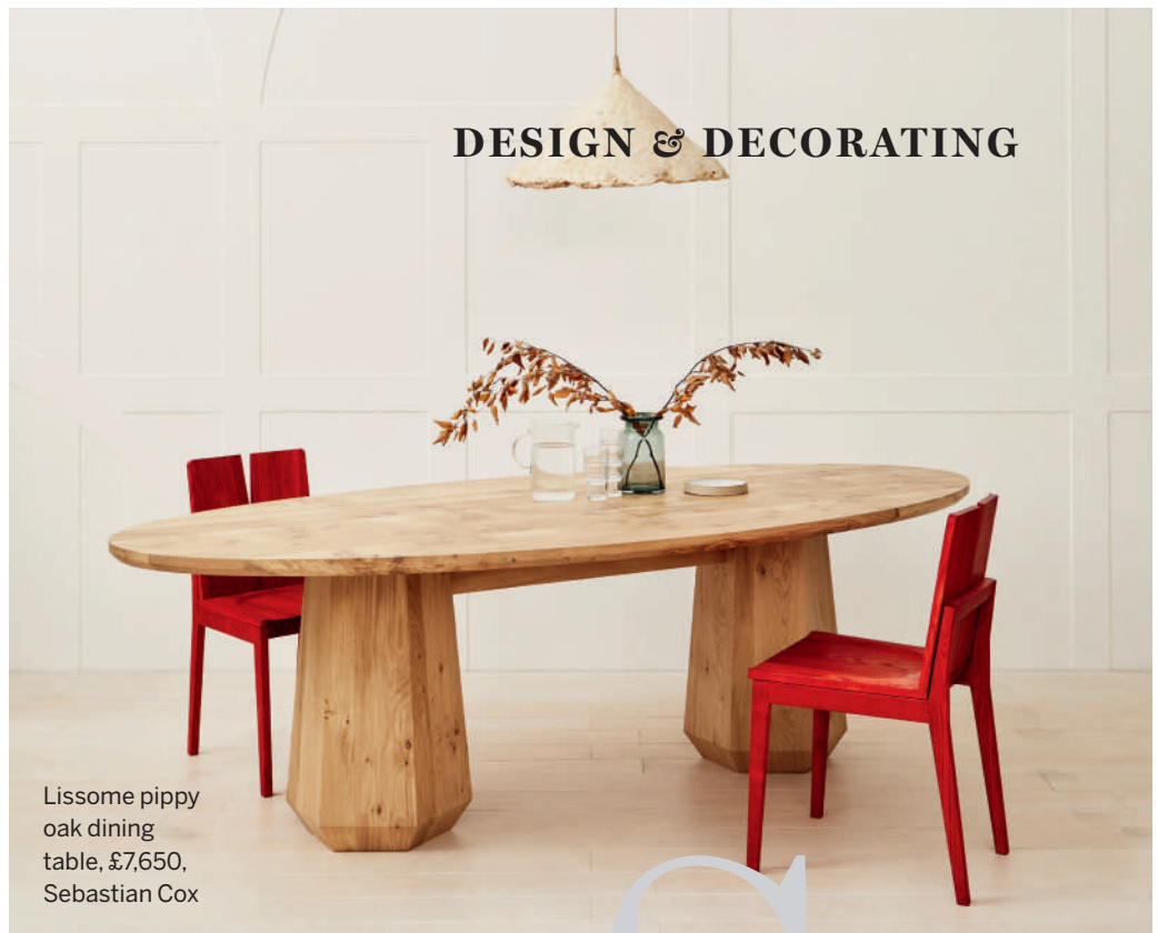
Lissome pippy oak dining table, £7,650, Sebastian Cox