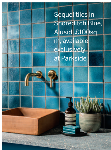
Sequel tiles in Shoreditch Blue. Alusid, £100/sq m, available exclusively at Parkside