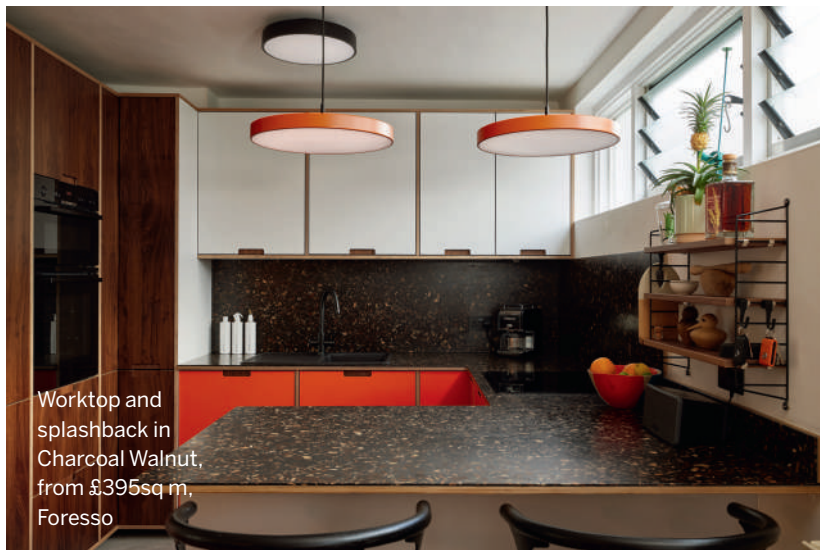
Worktop and splashback in Charcoal Walnut, from £395sq m, Foresso