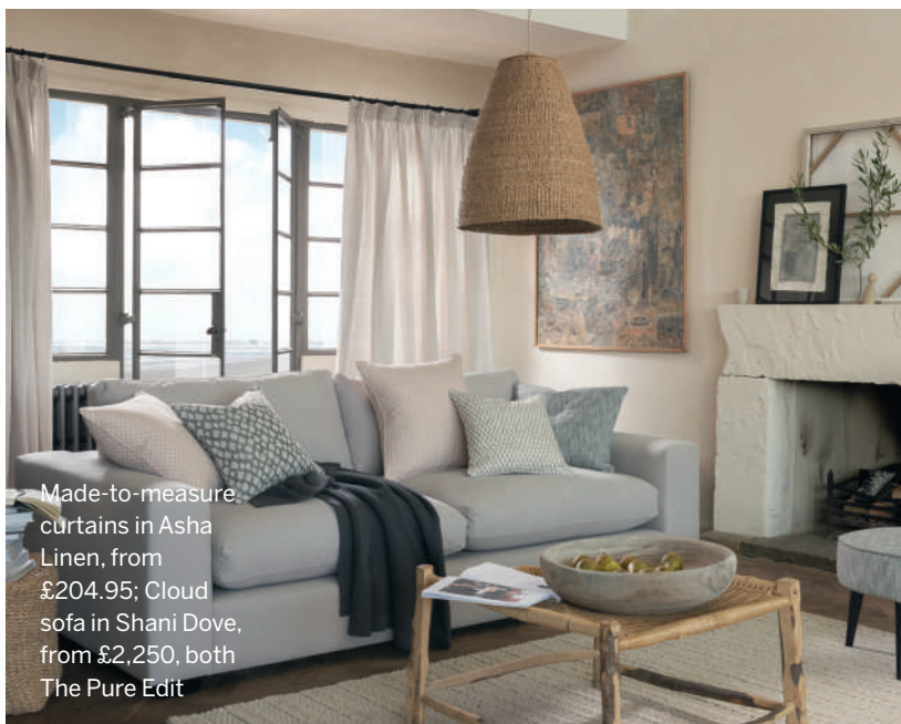
Made-to-measure curtains in Asha Linen, from £204.95; Cloud sofa in Shani Dove, from £2,250, both The Pure Edit