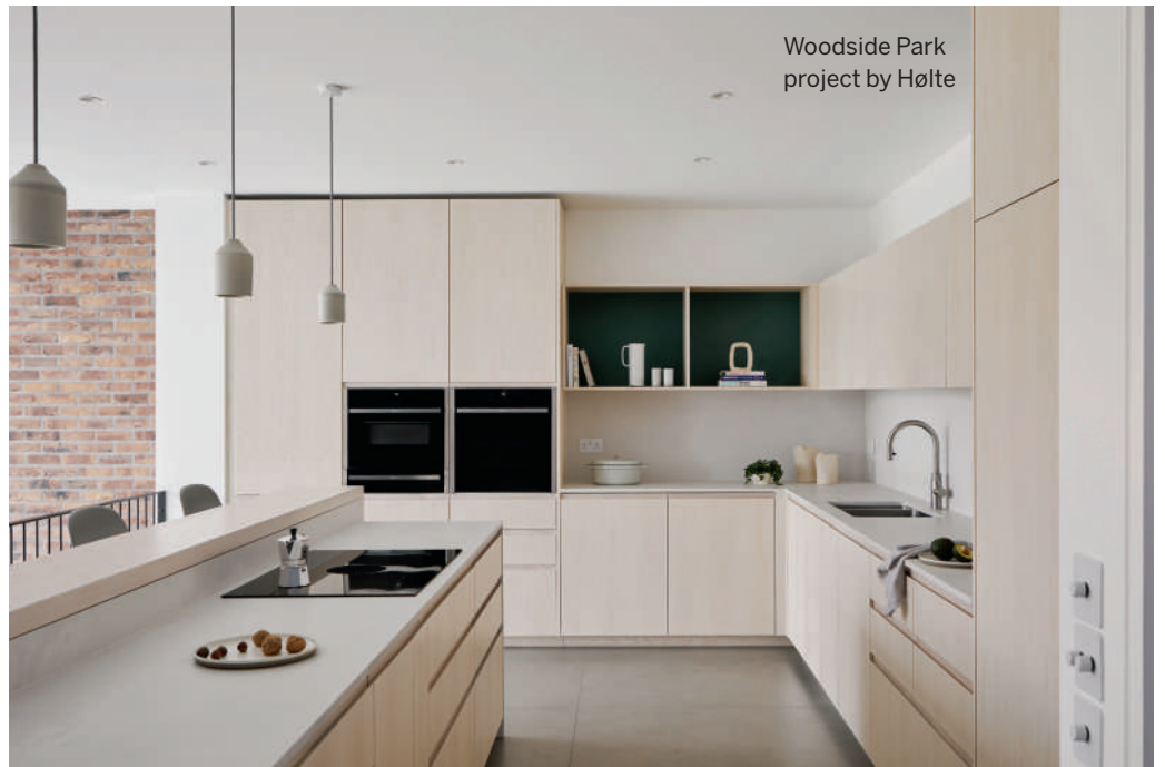
Woodside Park project by Hølte