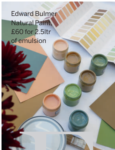
Edward Bulmer Natural Paint, £60 for 2.5ltr of emulsion