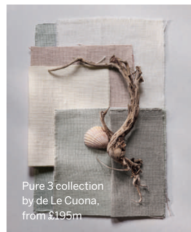
Pure 3 collection by de Le Cuona, from £195m