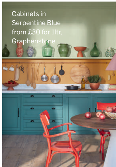
Cabinets in Serpentine Blue from £30 for 1ltr. Graphenstone