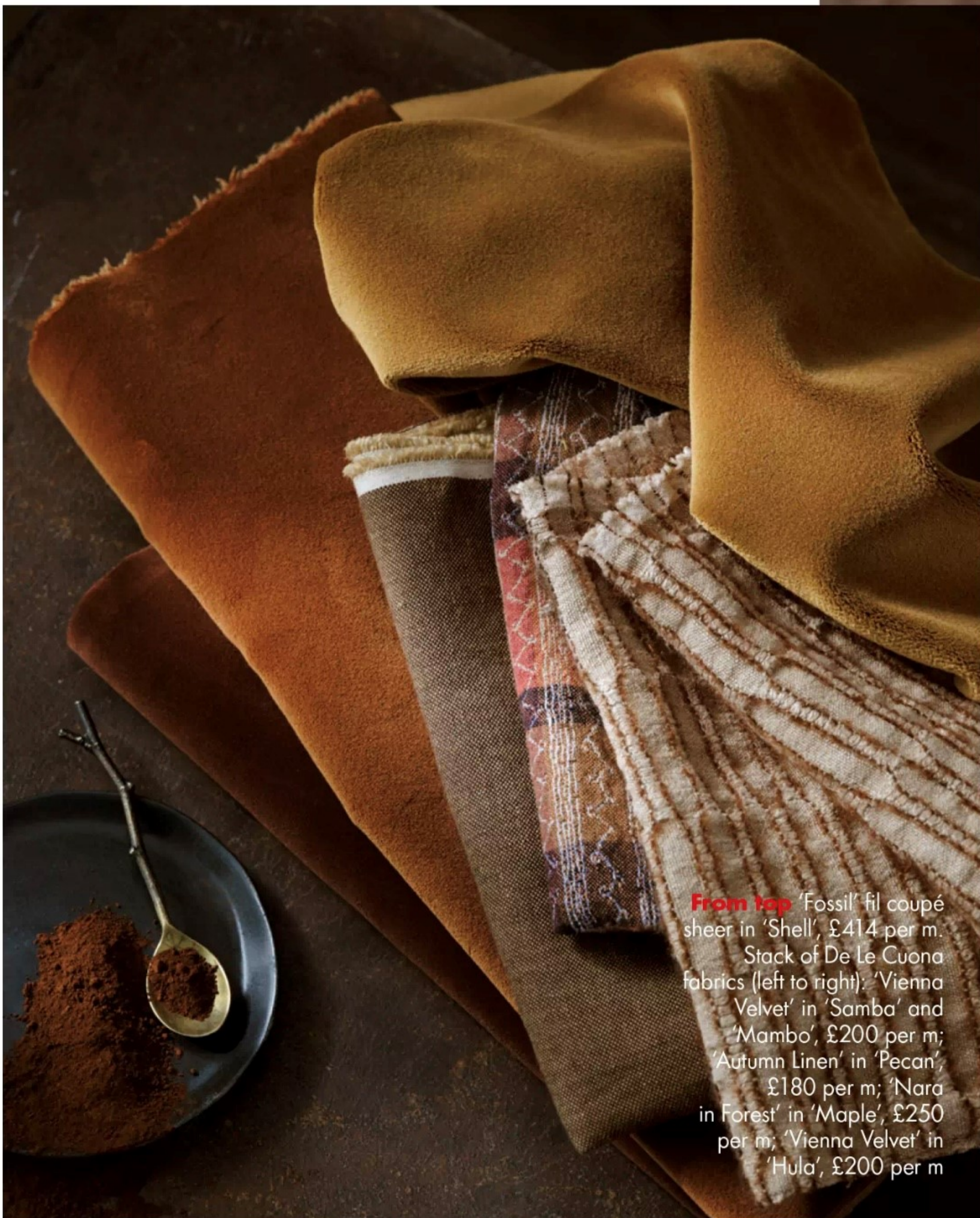
From top 'Fossil' fil coupé sheer in 'Shell', £414 per m. Stack of De Le Cuona fabrics (left to right): 'Vienna Velvet' in 'Samba' and 'Mambo', £200 per m; 'Autumn Linen' in 'Pecan', £180 per m; 'Nara in Forest' in 'Maple', £250 per m; 'Vienna Velvet' in 'Hula', £200 per m