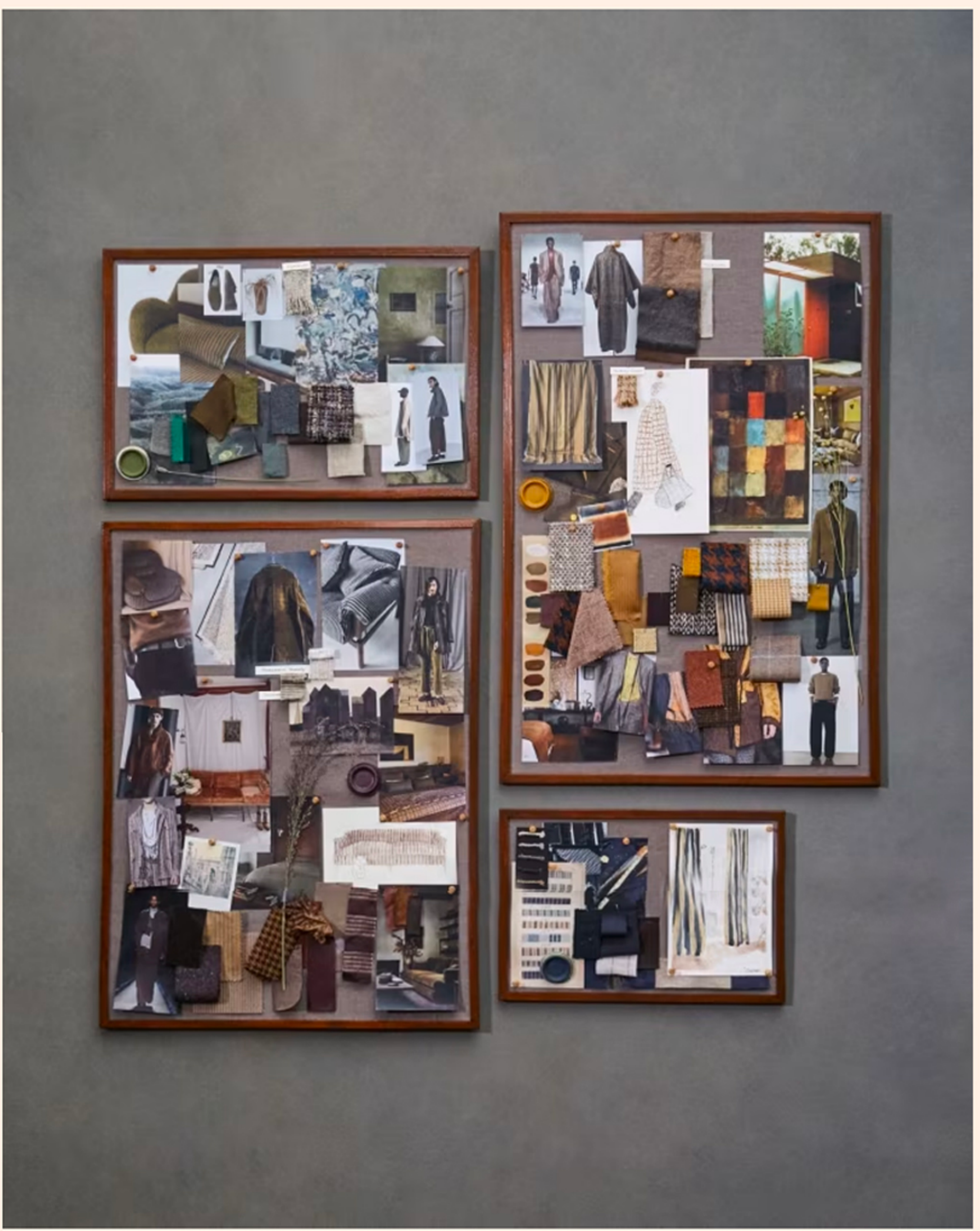
The moodboard for De Le Cuona's Natural Rebel collection, which reimagines classic tailoring

In this pop-up at Galerie Loevenbruck, the <u>purveyor of natural, sustainable</u> <u>fabrics</u> is unveiling Natural Rebel, a collection reimagining classic tailoring including pinstripes.