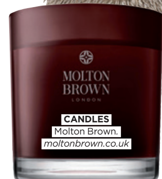
CANDLES Molton Brown. moltonbrown.co.uk