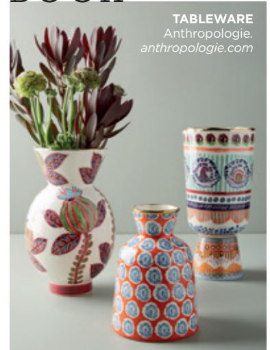
TABLEWARE Anthropologie. anthropologie.com