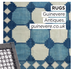
RUGS Guinevere Antiques. guinevere.co.uk