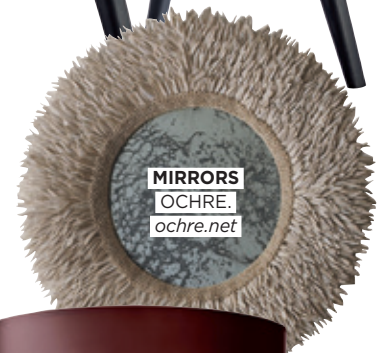
MIRRORS OCHRE. ochre.net