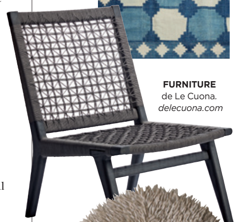
FURNITURE de Le Cuona. delecuona.com