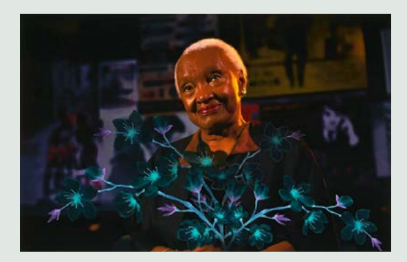
\label{eq:Carmen Munroe OBE @Sonia Boyce. All rights reserved, DACS 2023. \\

Cost of Non-Exclusive Sponsorship £2,500 (exc VAT)