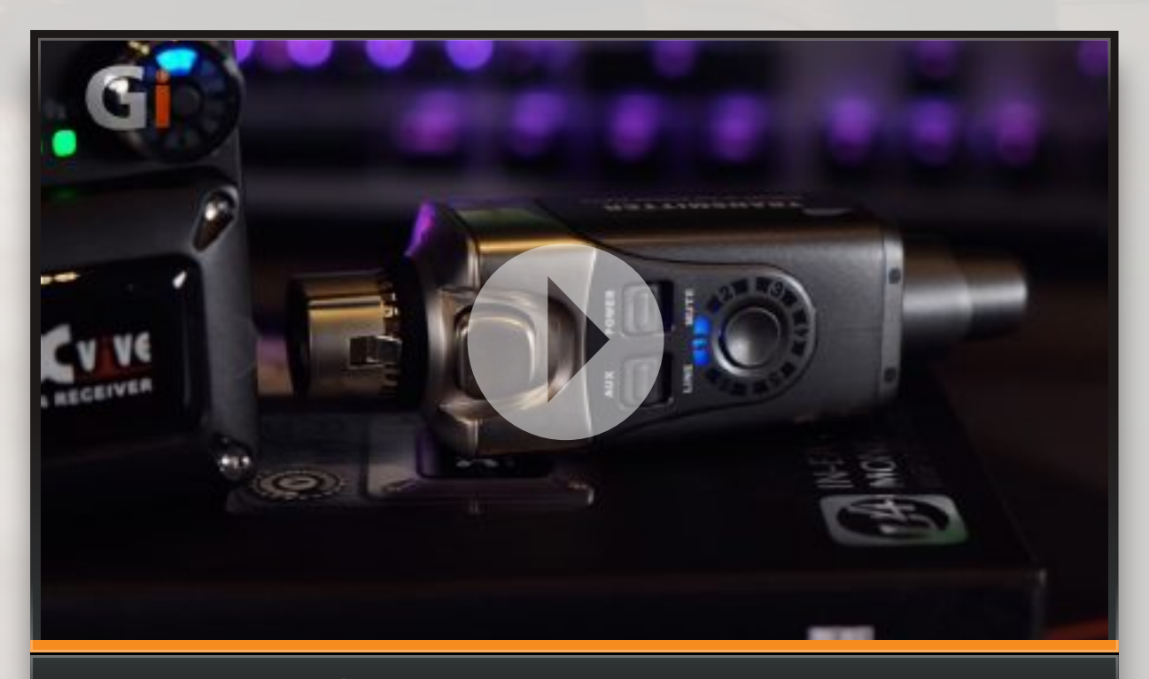
Xvive U4 Wireless Review - Tom Quayle

you regularly play in very large venues you may be better off with a higher bandwidth 5Ghz device. For most users the U4's 2.4Ghz operation will more than suffice and offer great stability with the 6 channels on offer. »