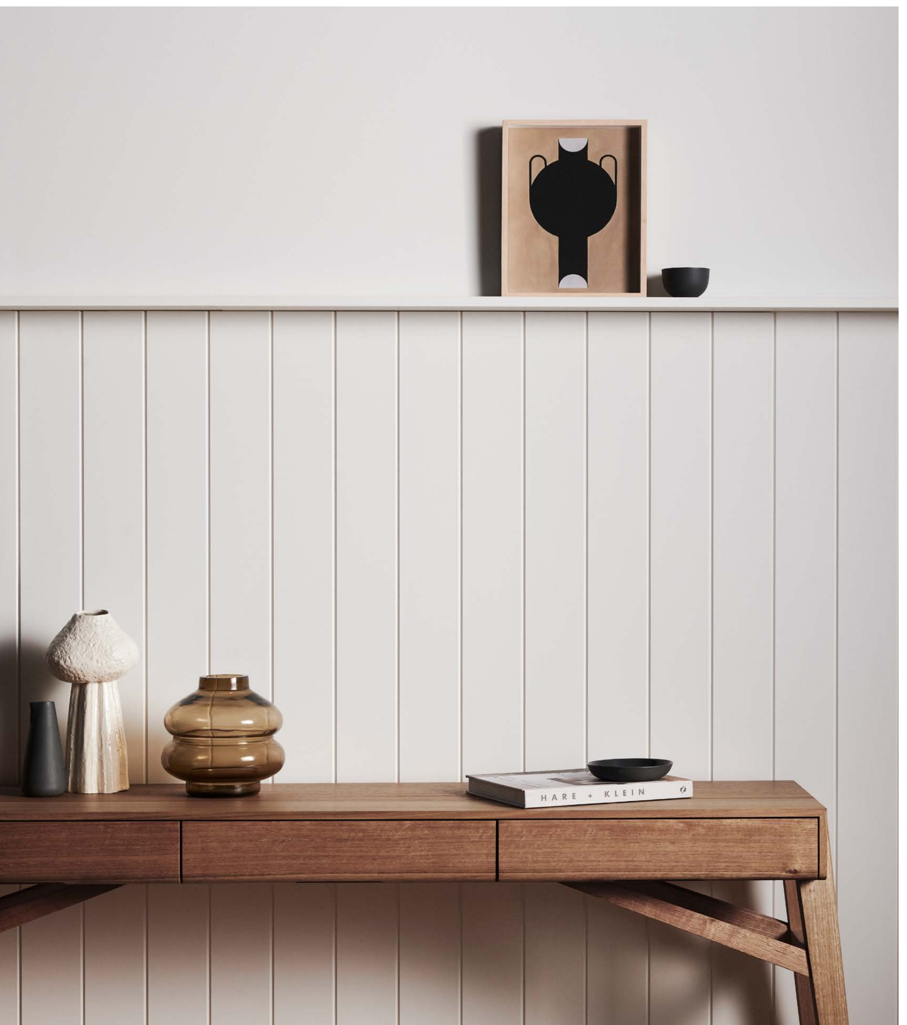
Classic VJ 100 along a modern hallway.

Consider panelling half of the wall to break up the wall surface and direct the eye to a particular focal point. Where you apply the profile is where your eye will be drawn in the space.