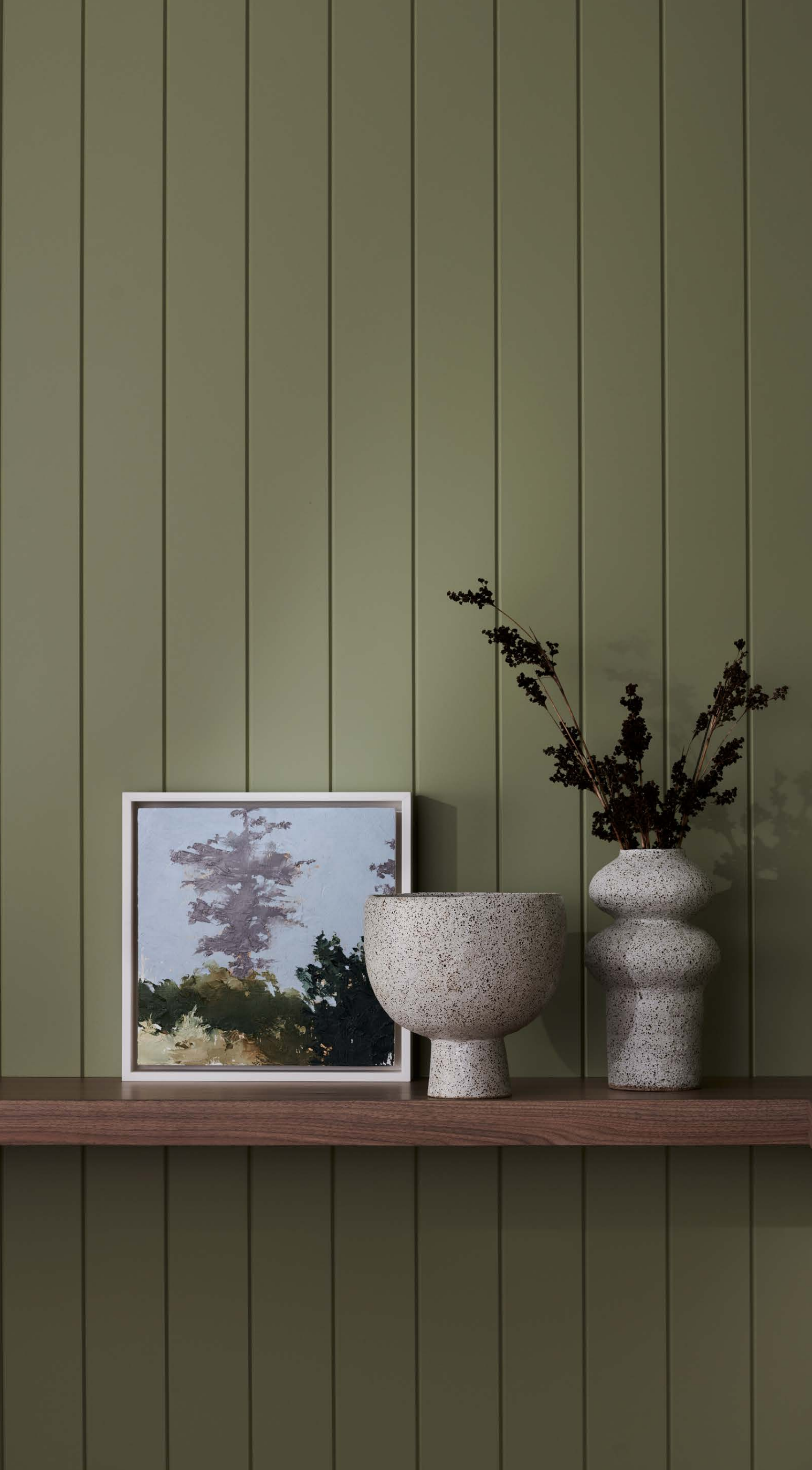
Classic VJ 100 creates calm in this Studio Esteta living room finished in Dulux Spores.