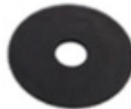
Locating Rubber Washer