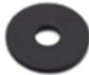
Escutcheon Plate Rubber Washer