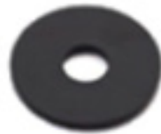
Escutcheon Plate Rubber Washer