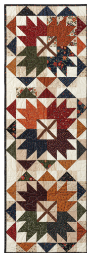
FALL FESTIVAL II

*The supply list above makes 2 table runners. If your package of 10" squares includes a different variety of fabric from ours, you may need additional dark fabrics not shown in the supply list above.