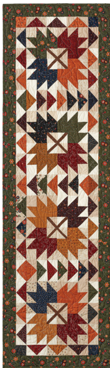
FALL FESTIVAL I