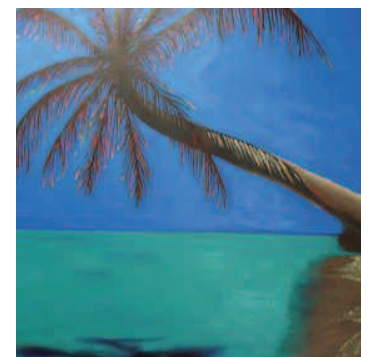
Step 7: Painting the Ocean

To paint the trunk and part of the sand we need to create some earthy tones, to do this use a mix of Umber and Zink White. Apply the darkest brown on the bottom of the trunk and the lightest on the top to make it look tubular. Then place some lighter stripes on the trunk to suggest light filtering through the fronds.