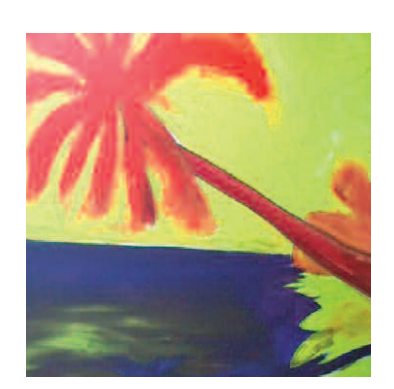
Step 2: The Underpainting

The palm tree drawing consists of a horizon line, 2 lines for the trunk of the palm tree and a rough suggestion for where the fronds lie. This could not be any more simple.