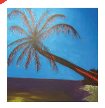
Step 5: Painting the Sky

For the sky, create a mix in to a deep well Plastic Palette of 6 parts Cyan to 4 parts white. With this mix, block the sky in with the 75 mm wide brush, get as close to the fronds as you can. Now use the Angle brush to bring the colour in to the area between each frond.