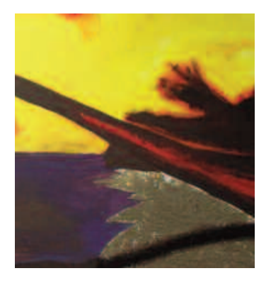
Step 3: Applying Sand

Squeeze out the Silver Series Rose Madder, Lemon Yellow and Purple on to the traditional Wood Palette. Start with the Yellow and paint in the sky and beach. Then rough in the palm tree and the background trees using mix of Rose Madder and Yellow and paint the ocean in Purple. It may look strange but this underpainting gives the final piece a beautiful warmth.