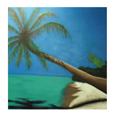
Step 8: Adding the Greens

To paint the beach, roughly apply Zinc white with a spot of Burnt Umber, and scumble this over the sand.