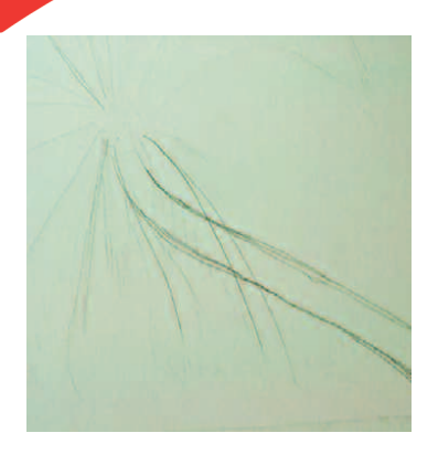
Step 1: Drawing in the Palm Tree

The palm tree drawing consists of a horizon line, 2 lines for the trunk of the palm tree and a rough suggestion for where the fronds lie. This could not be any more simple.