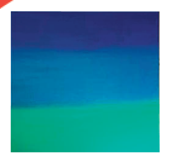
Step 1: Painting the Background

Divide your Canvas into 3 equal parts as shown. Paint the top section with Cobalt Blue, the middle with Monastral and the bottom with Turquoise, blending them together as you go. This creates a lovely gradient that will really make the poppies stand out.