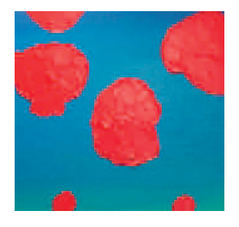
Step 3: Painting the Red Poppies

Using the image on the last page of this pdf as a reference, draw in the poppy shapes using a 6B graphite pencil.