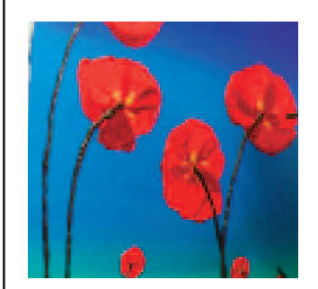
Step 6: Painting the Stalks

In this step make a mix from 2 parts lemon yellow to 2 parts gloss medium, paint this on the centre of the flower and over the petals here and there.