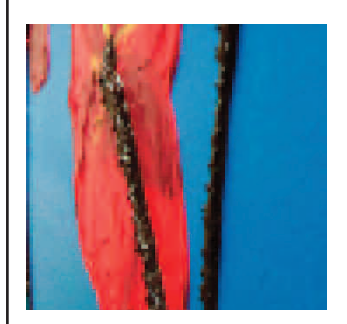
Step 7: Adding Detail to the Stalks

Start with creating the smaller stalks. Do this by using a pencil, to pierce a small hole in the top of the Burnt Umber tube's seal. Then simply squeeze out a line for the stalk directly onto the Canvas. To create a bigger stalk, simply peel of the seal and repeat the process. Smooth in the part where the stalk meets the flower with your pencil. This technique creates fantastic 3D stalks.