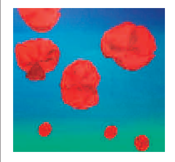
Step 4: Adding detail to the Poppies

Make a warm Red mixture of 1 part Lemon yellow to 3 parts Azo Vermillion. Lay the painting on the floor and spoon the paint onto the poppies, then using a Palette Knife smooth the paint out to follow the contours of your drawing. This can be made easier by doing it gently and keeping your strokes in similar directions. Allow the paint to fully dry before moving to the next step.