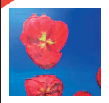
Step 5: Adding a Yellow Glaze

In this step make a mix from 2 parts lemon yellow to 2 parts gloss medium, paint this on the centre of the flower and over the petals here and there.