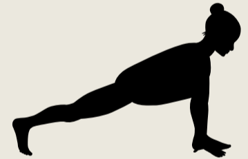
Left leg back (right leg forward) Raise the head.