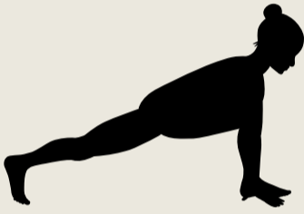
Right leg back (left leg forward) Raise the head.