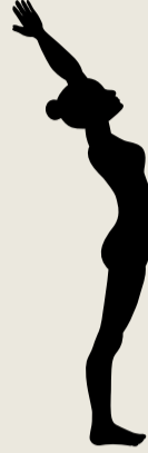
Sky reaching pose. Raise the arms upwards, slowly bend backward, stretching arms above the head.