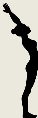
Raise the arms upwards, slowly bend backward, stretching arms above the head.