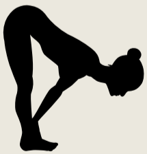
Hand-foot pose. Standing forward bend.