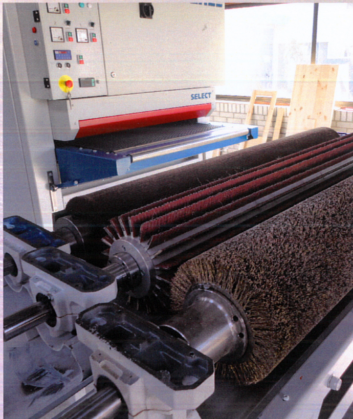
Quickly exchangeable brushes