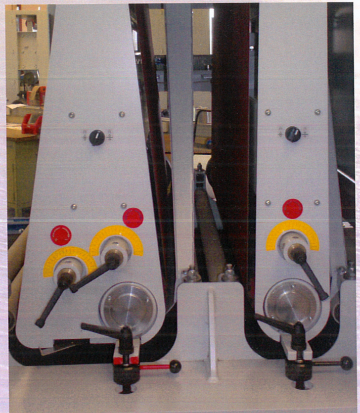
Units combination KC