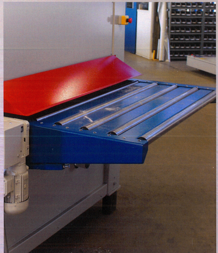
Outfeed roller table