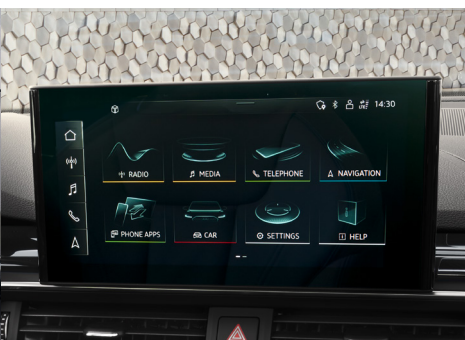
MMI navigation plus with MMI touch