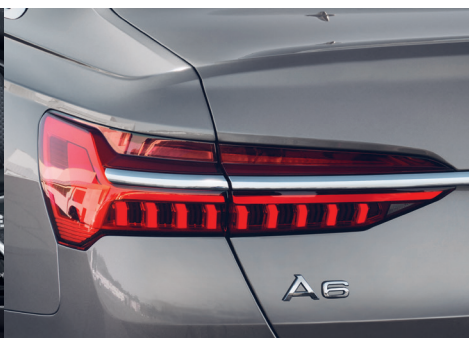
LED rear lights with dynamic indicators