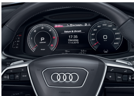
Audi virtual cockpit plus