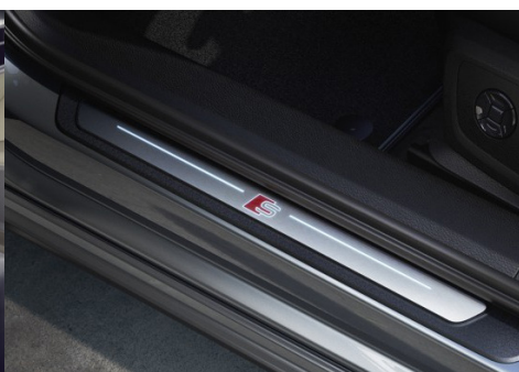
Front aluminium scuff plates, illuminated with "S" logo