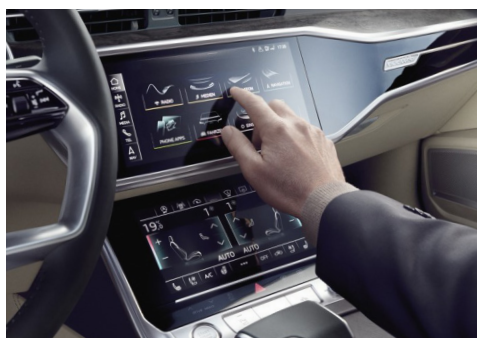
MMI navigation plus with MMI touch response