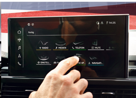
MMI navigation plus with MMI touch