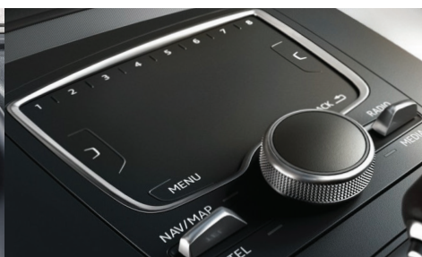
MMI navigation plus with MMI touch