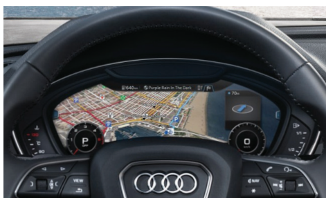
Audi virtual cockpit