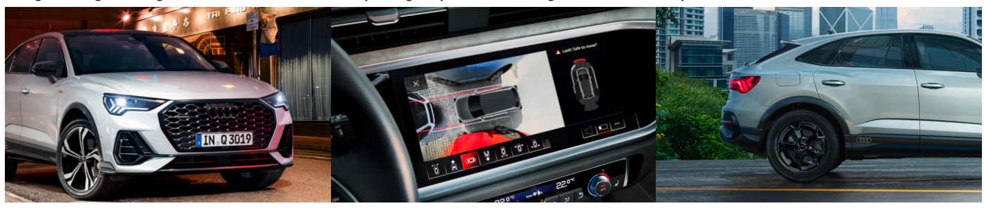
Actual specifications may vary from model shown. Information is accurate as at March 2024