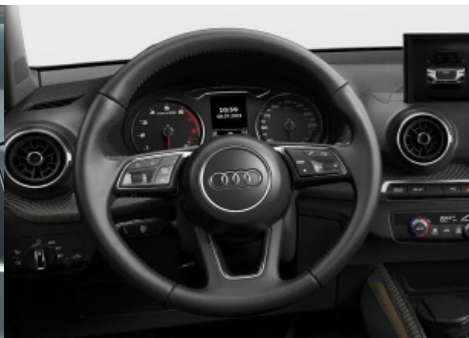
Multifunction steering wheel