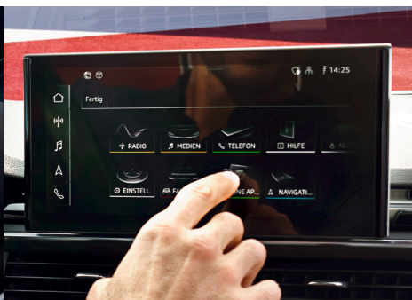
MMI navigation plus with MMI touch