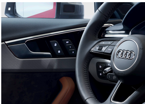
Memory function for driver's seat