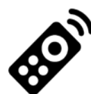
Remote Control Function