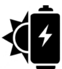
Solar Panel Battery

Courtyard, Garden, Park, Street, Pathway, Parking lot, Private road, Sidewalk, Public square, Plaza, Airfield, Farm & Ranch, Perimeter Security, Wildlife area, High way.