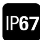
Water and dust proof