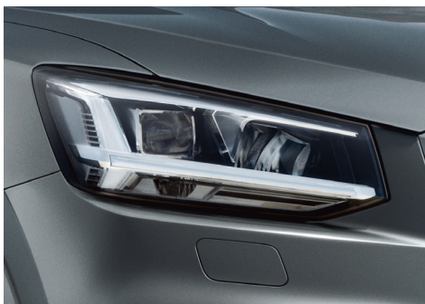
LED headlights with headlight washers