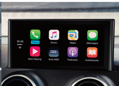
Audi smartphone interface