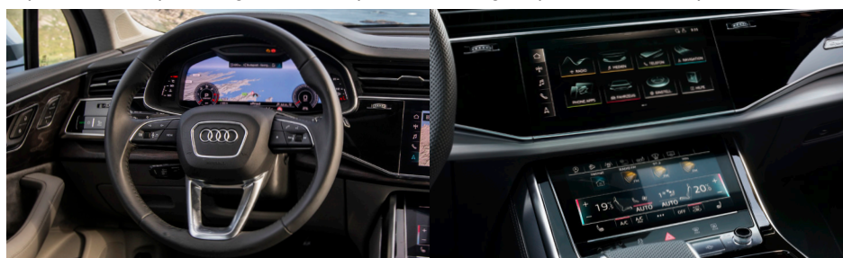
3-spoke multifunction plus steering wheel with shift paddles MMI navigation plus with MMI touch response