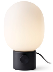
Black Steel 1810539