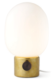
Polished Brass 1800839