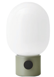
Ammonite Grey, Steel 1800089