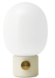
Alabaster White, Steel 1800360