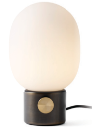
Bronzed Brass 1800859