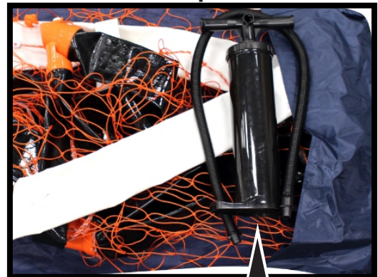
PLACE PUMP HERE