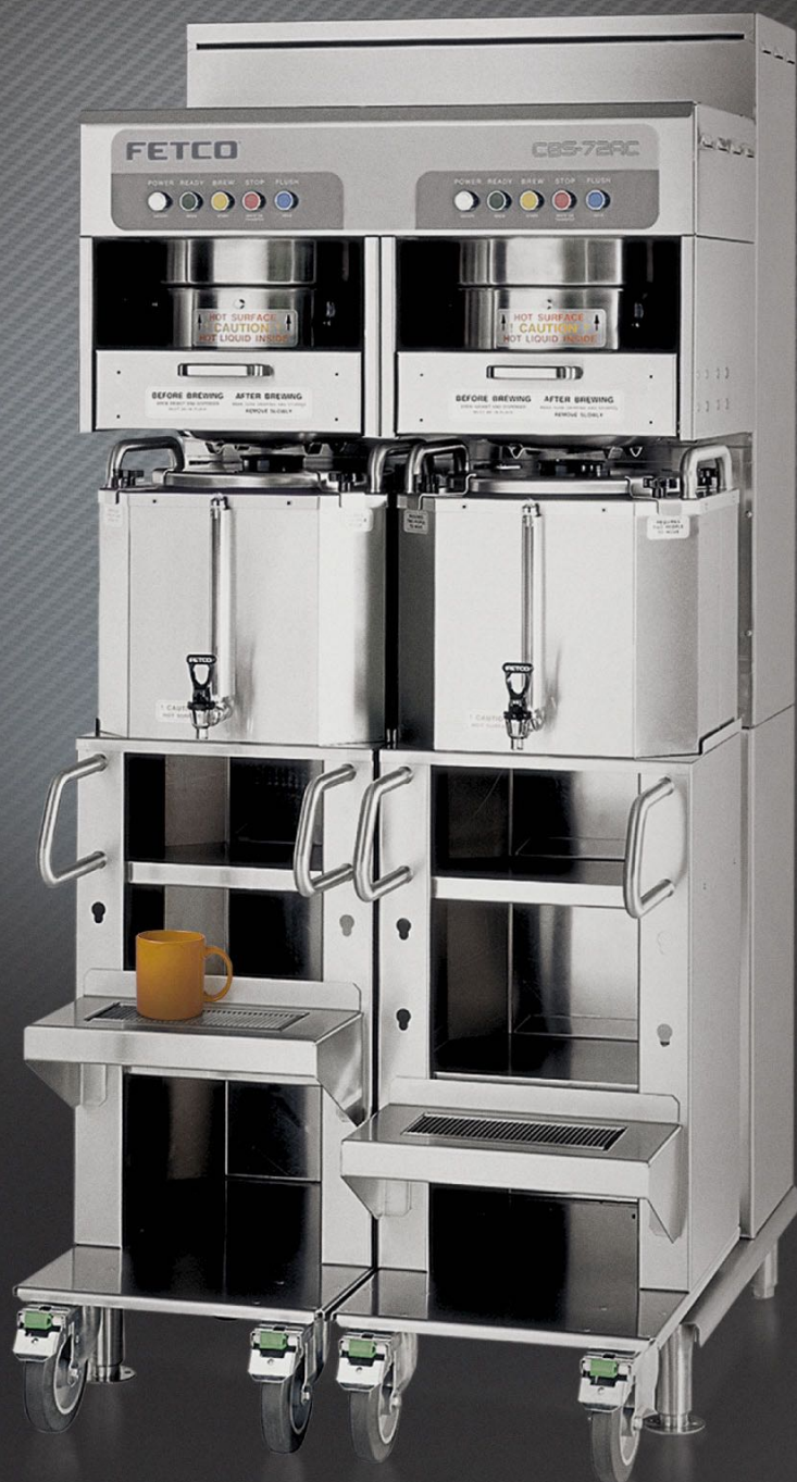
Shown with 6.0 Gallon Mobile LUXUS® Thermal Dispenser (LBD-6C) and Serving Station for LBD-6 with Drip Tray

FETCO® is the category expert and the ONLY manufacturer of ultra high-volume (7-24 Gallon) portable coffee brewing systems for very large scale operations. Due to the high capacity output and reliable performance the CBS-7000 Series is the preferred choice for specification in hotels, stadiums, convention centers and other large venues.