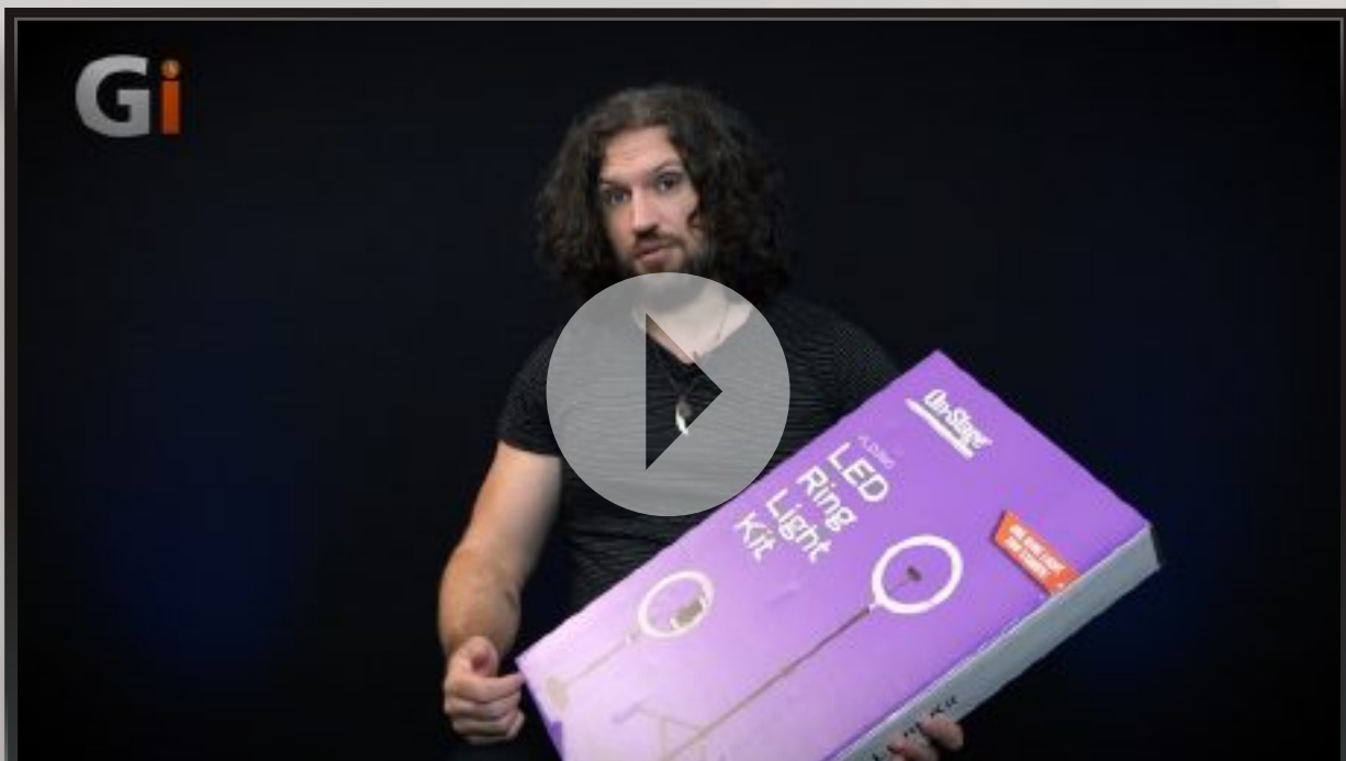
On-Stage Influencer Starter Kit

That just leaves “something to stand in front of”. If you have access to a cool-looking space, or even just somewhere you can hang a backdrop, you're good to go. But if everywhere you have access to looks sub-par on camera, you might try a green screen. The VSM3000 Green Screen Kit »