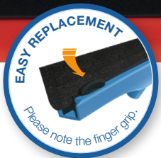
Classic double bladed