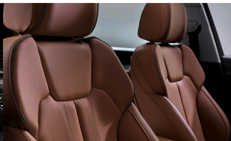
Electrically adjustable front sport seats