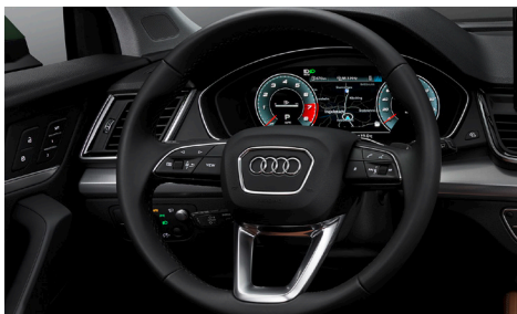
3-spoke leather steering wheel with multifunction plus