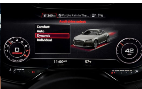
Audi drive select