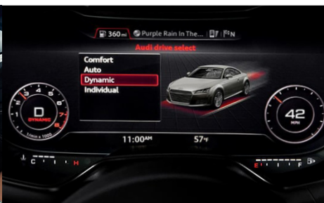
Audi drive select