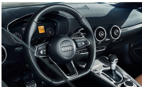
TT sport contour leather steering wheel, flat-bottomed