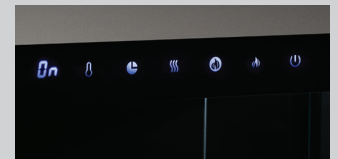
TOUCH SCREEN CONTROL PANEL WITH MOTION PROXIMITY SENSOR