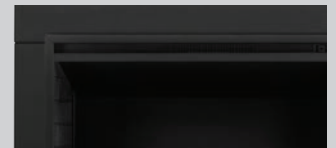
OPTIONAL 3/4PC TRIM KIT