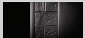
BRICK SIDE PANEL