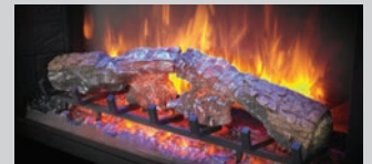
TOP LIGHT ACCENTUATES MEDIA