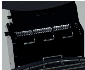
Easy lift hinge system