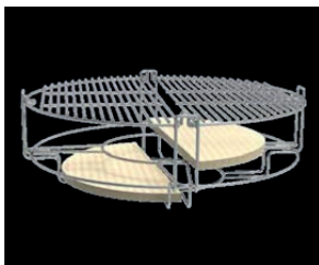
Adjustable heights and shapes of grids