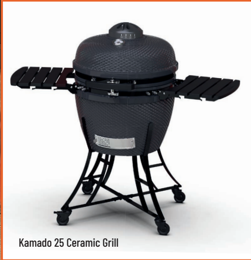
Kamado 25 Ceramic Grill