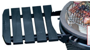
Two fold-down, composite side shelves