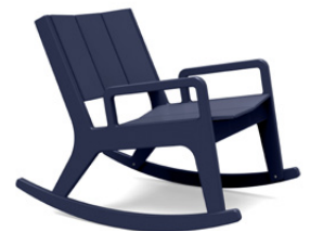
navy blue: NO-NO9R-NB