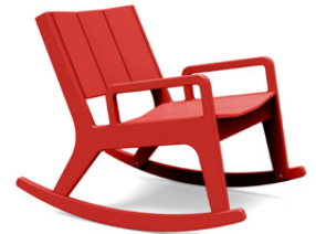
apple red: NO-NO9R-AR