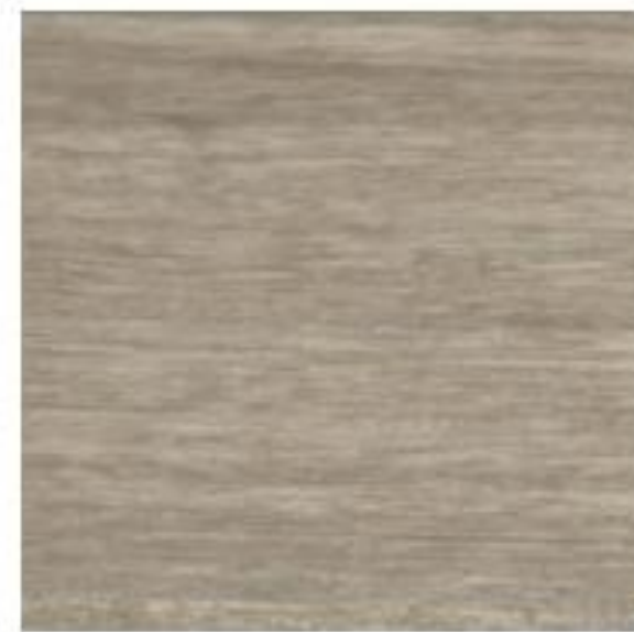
Natural Teak (at 1 year)