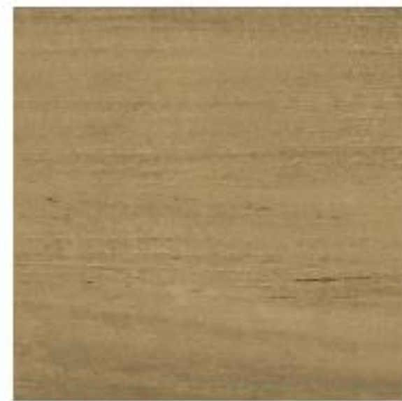
Natural Teak (at 6 months)