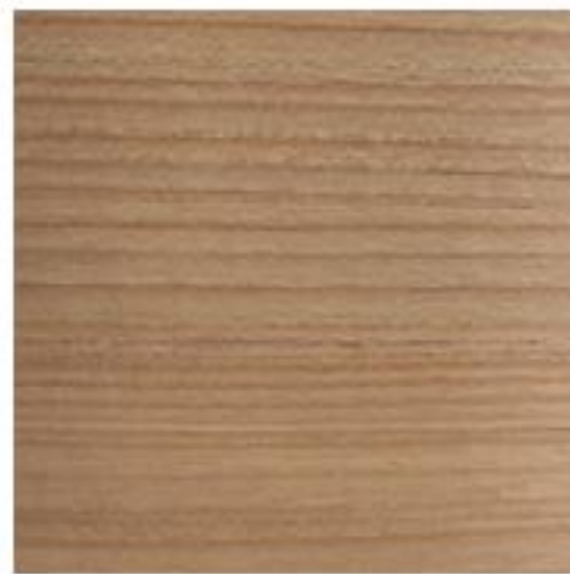
Natural Teak (new)