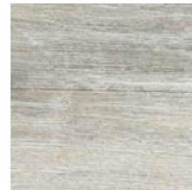
Finished Teak - Weathered finish (at 5 years)