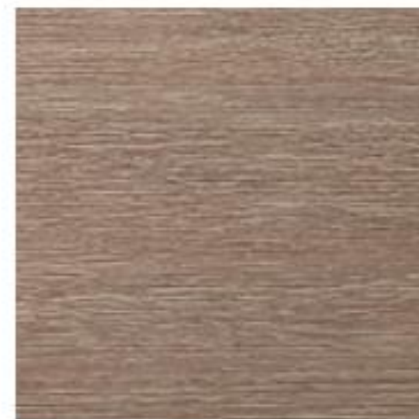
Finished Teak - Weathered finish (new)