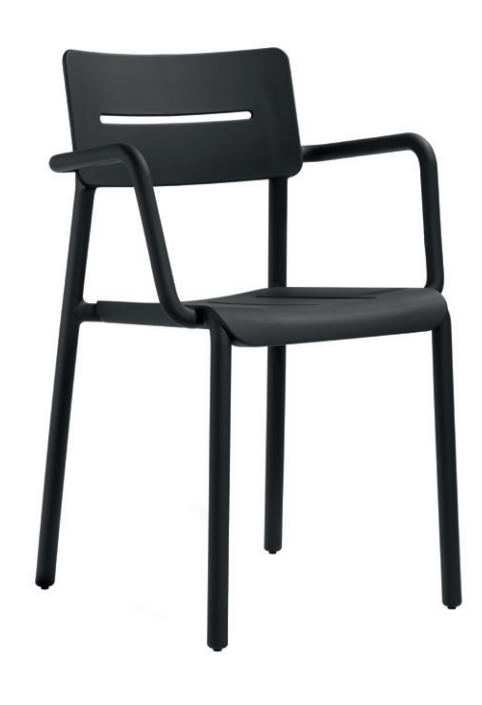
OUTO ARMCHAIR Structure in polypropylene. Color black and white.