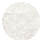
Diamond Cream L01D