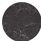
Nero Greco L02N