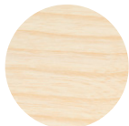
Natural ash A01N