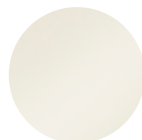
Acid etched white glass B01W