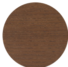
Walnut stained ash A06W