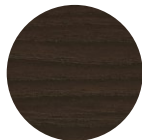
Carbon stained ash A02C