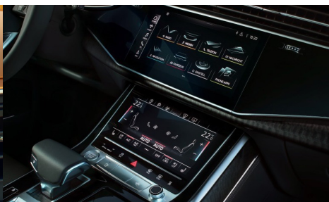
MMI navigation plus with MMI touch response