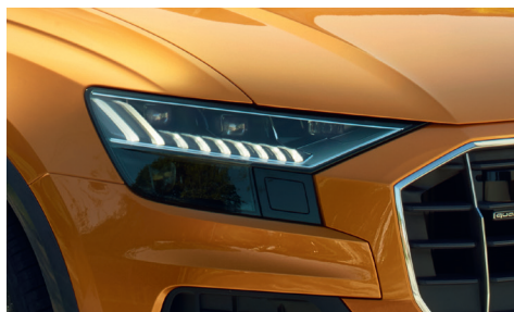
HD Matrix LED headlights