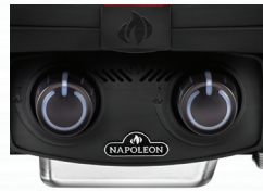
Ergonomic Control Knobs