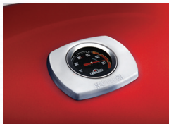
ACCU-PROBE™ Temperature Gauge