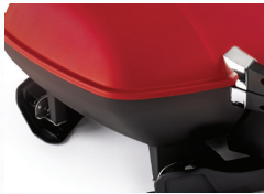
Folding Legs for Storage