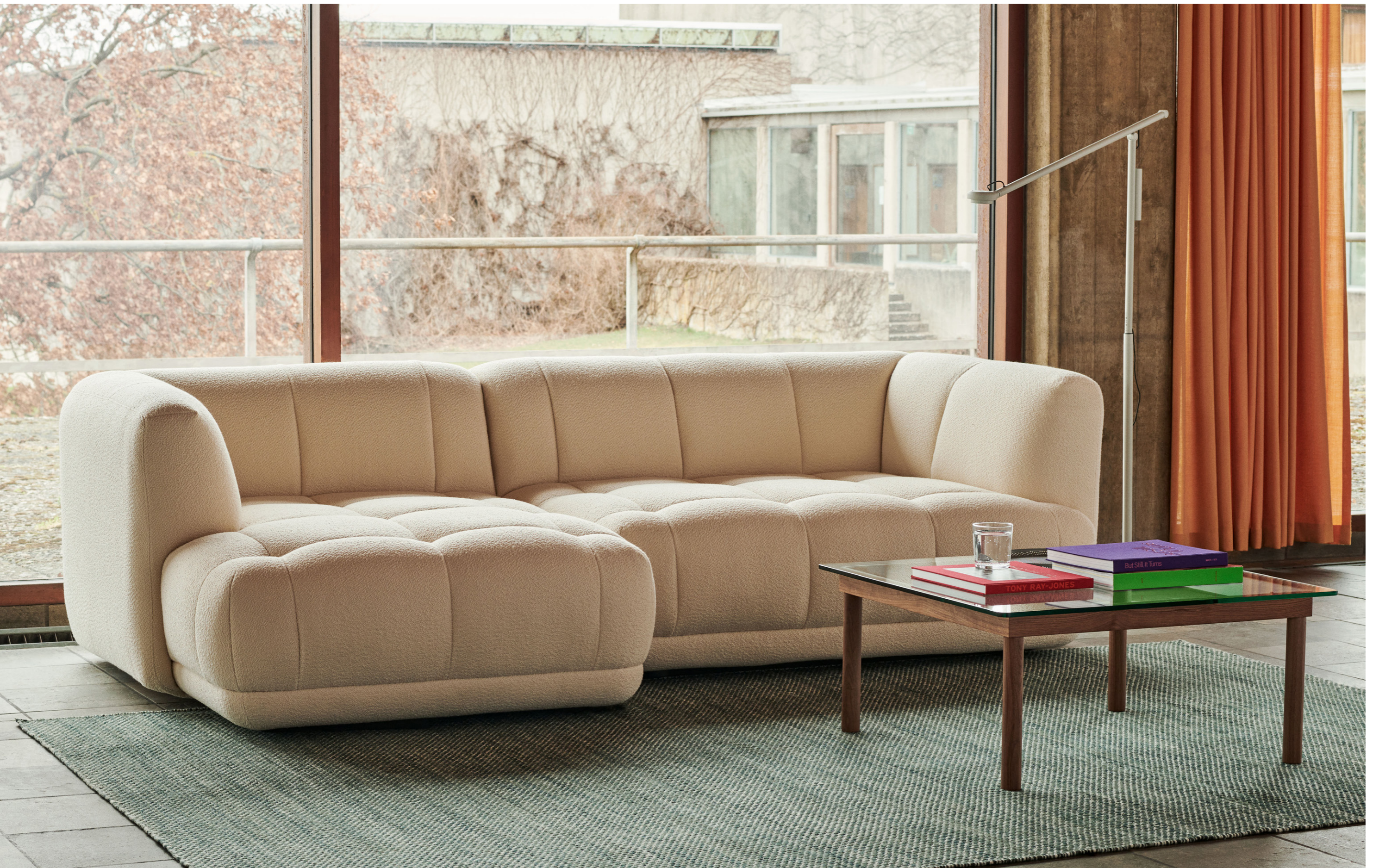
Quilton Combination 19 Left, Flamiber Cream A5