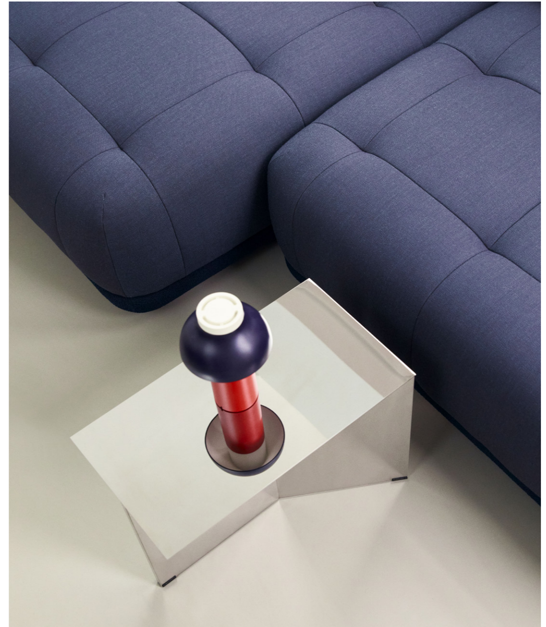
Quilton Duo, front Atlas 881, back & base Flamiber Dark blue J4