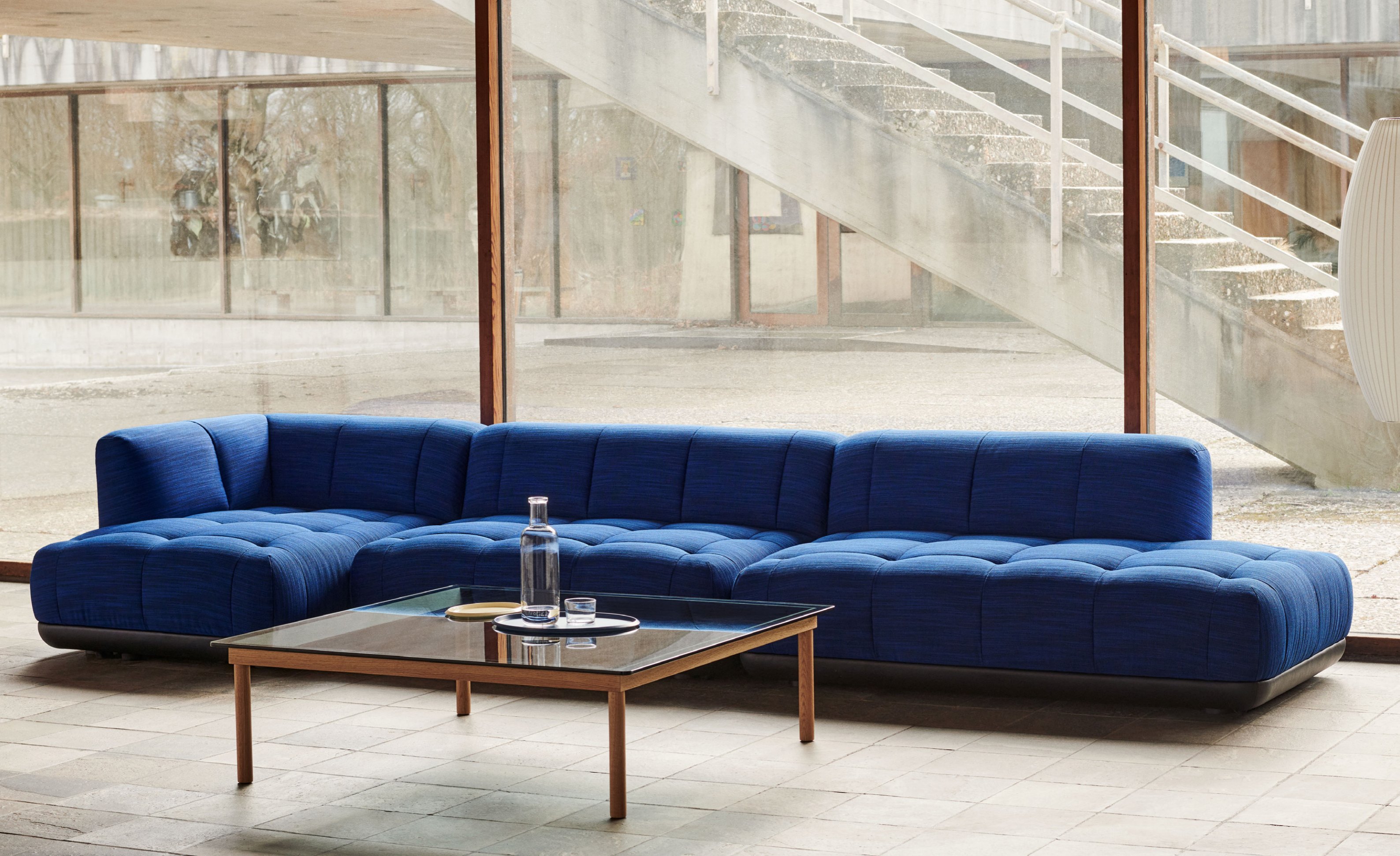
Quilton Contrast base Combination 23 Left, Raas 772