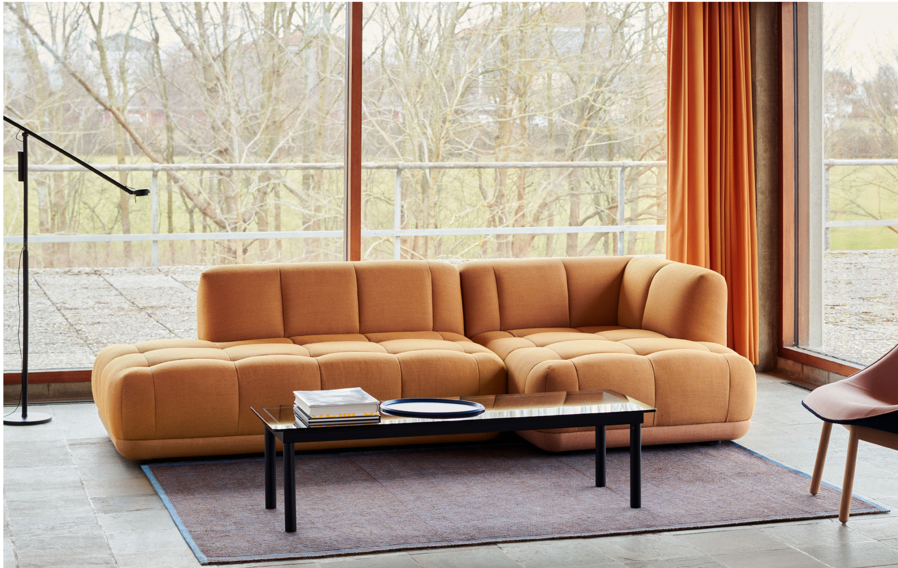
Quilton Duo Combination 21 Right, front Fiord 442, back & base Remix 252