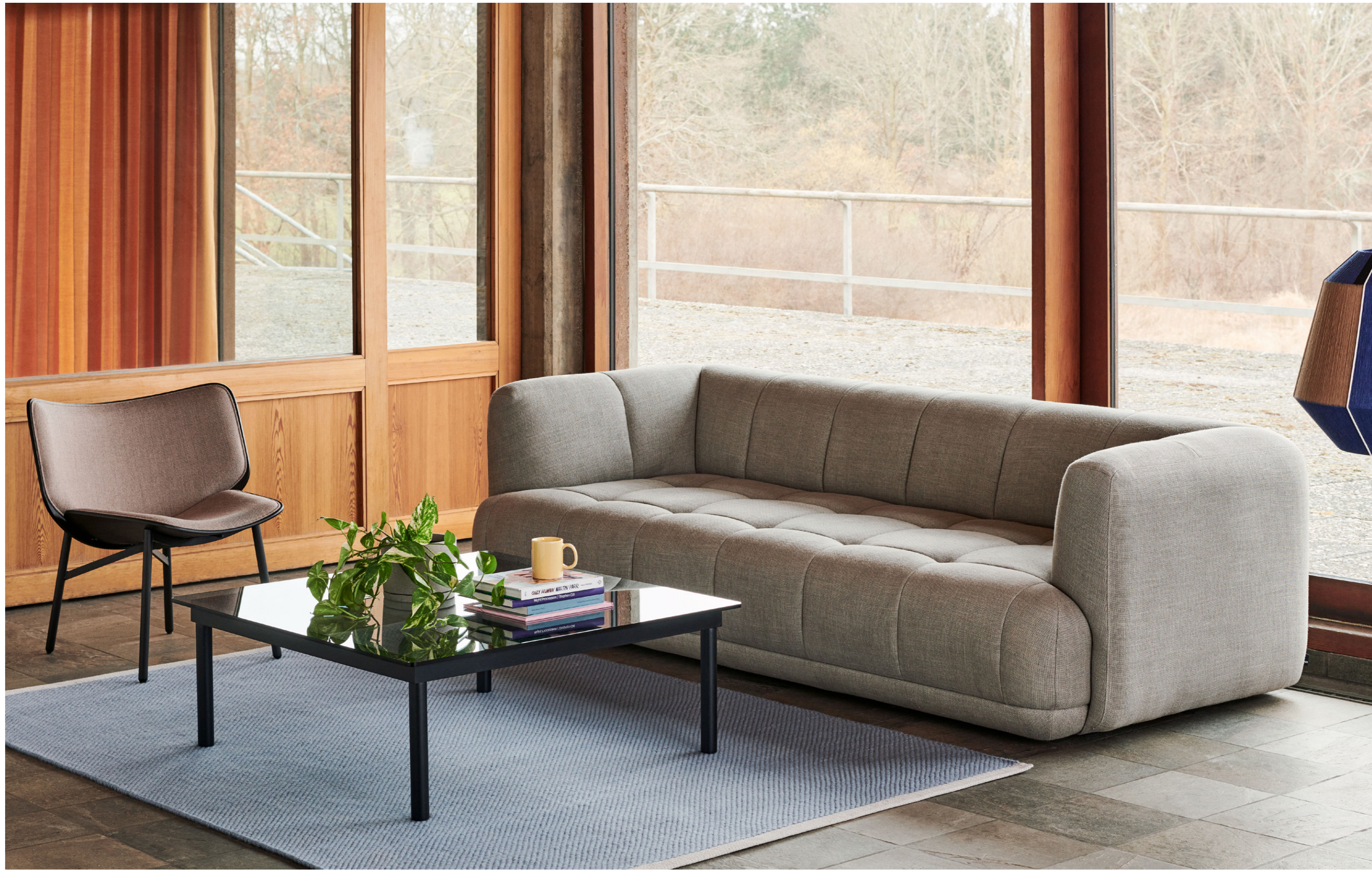
Quilton 3 Seater, Linen Grid Adriatic blue Dapper, Re-Wool 628