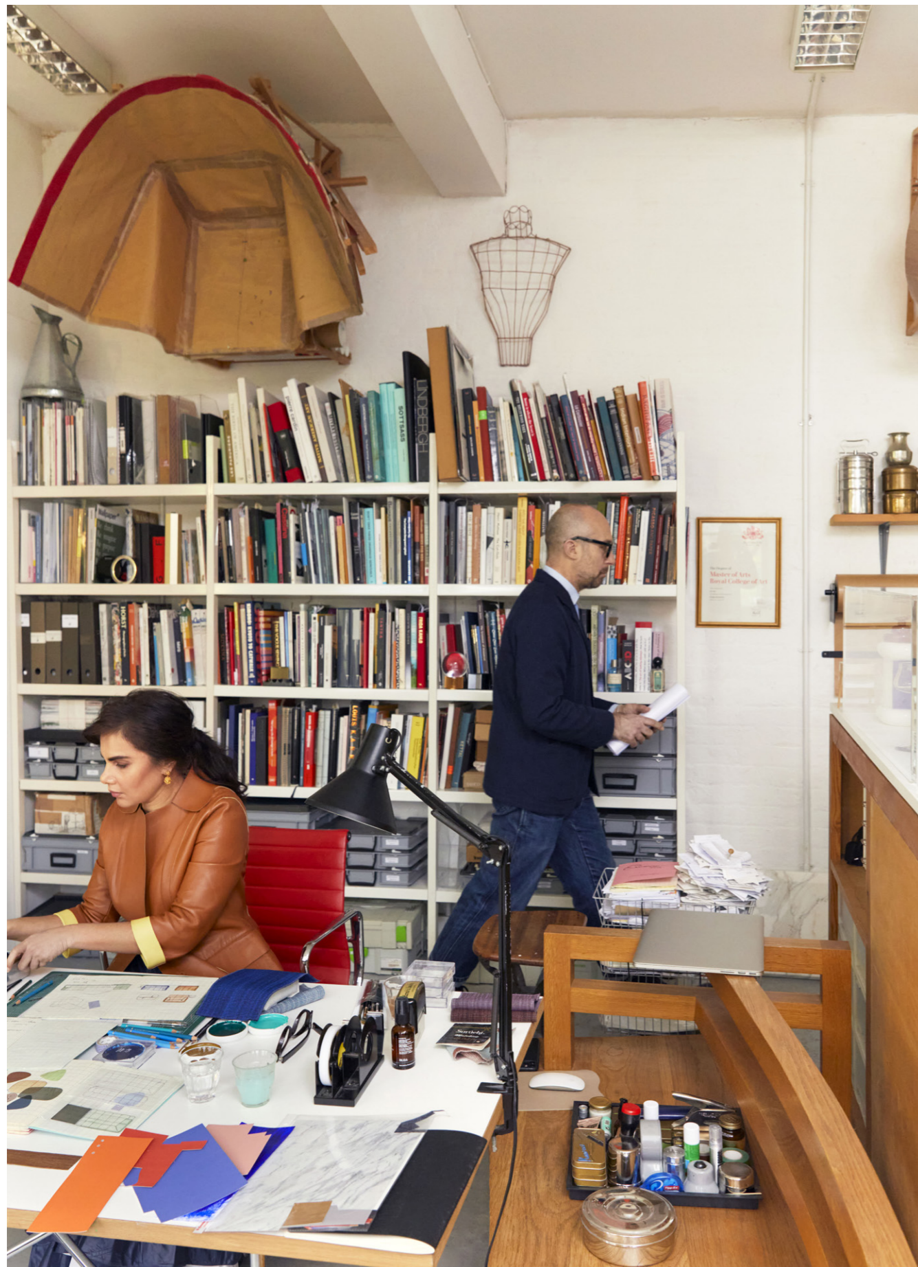
Doshi Levien's creative hub - their London-based design studio.