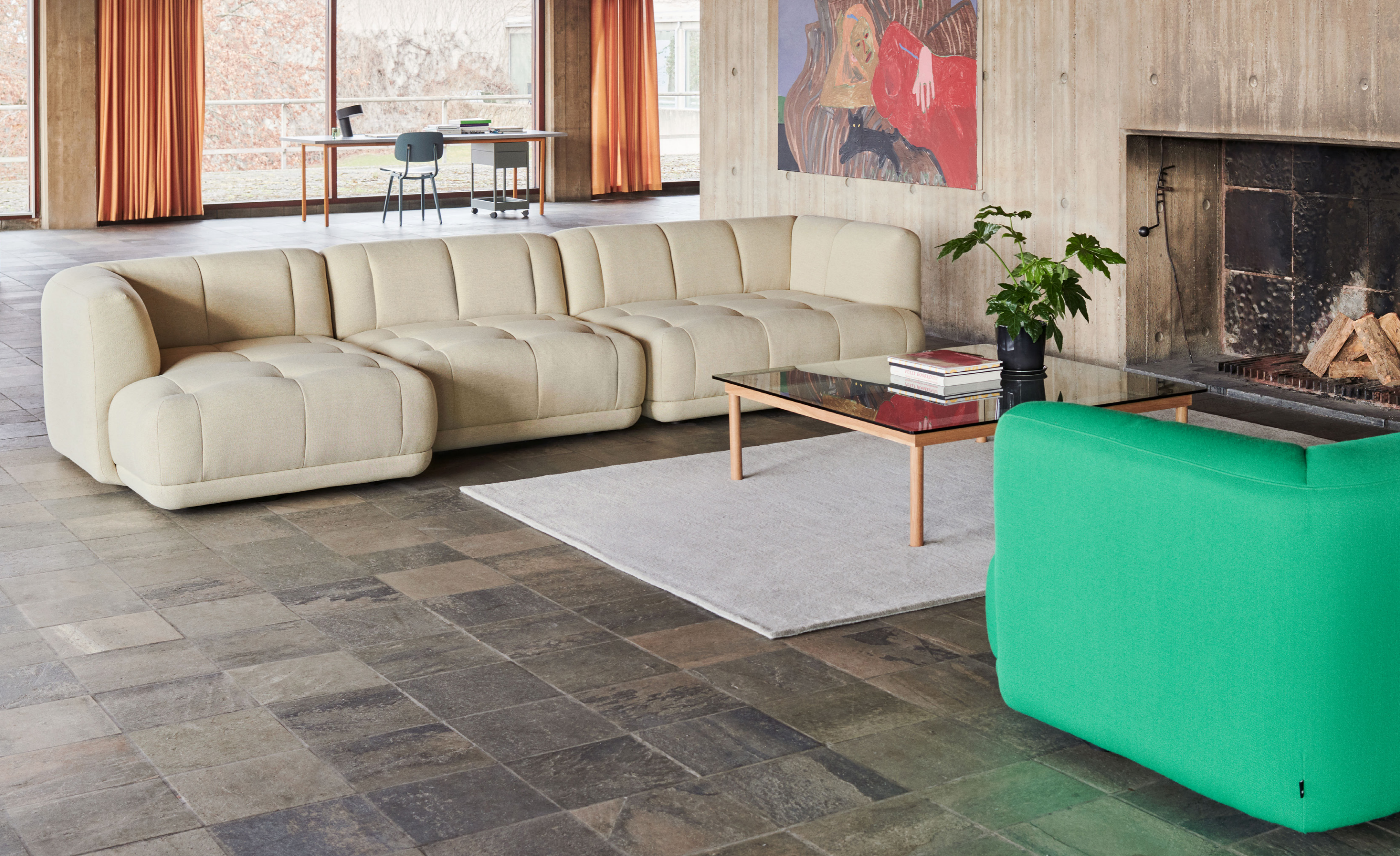
Quilton Combination 17 Left, Mode 014