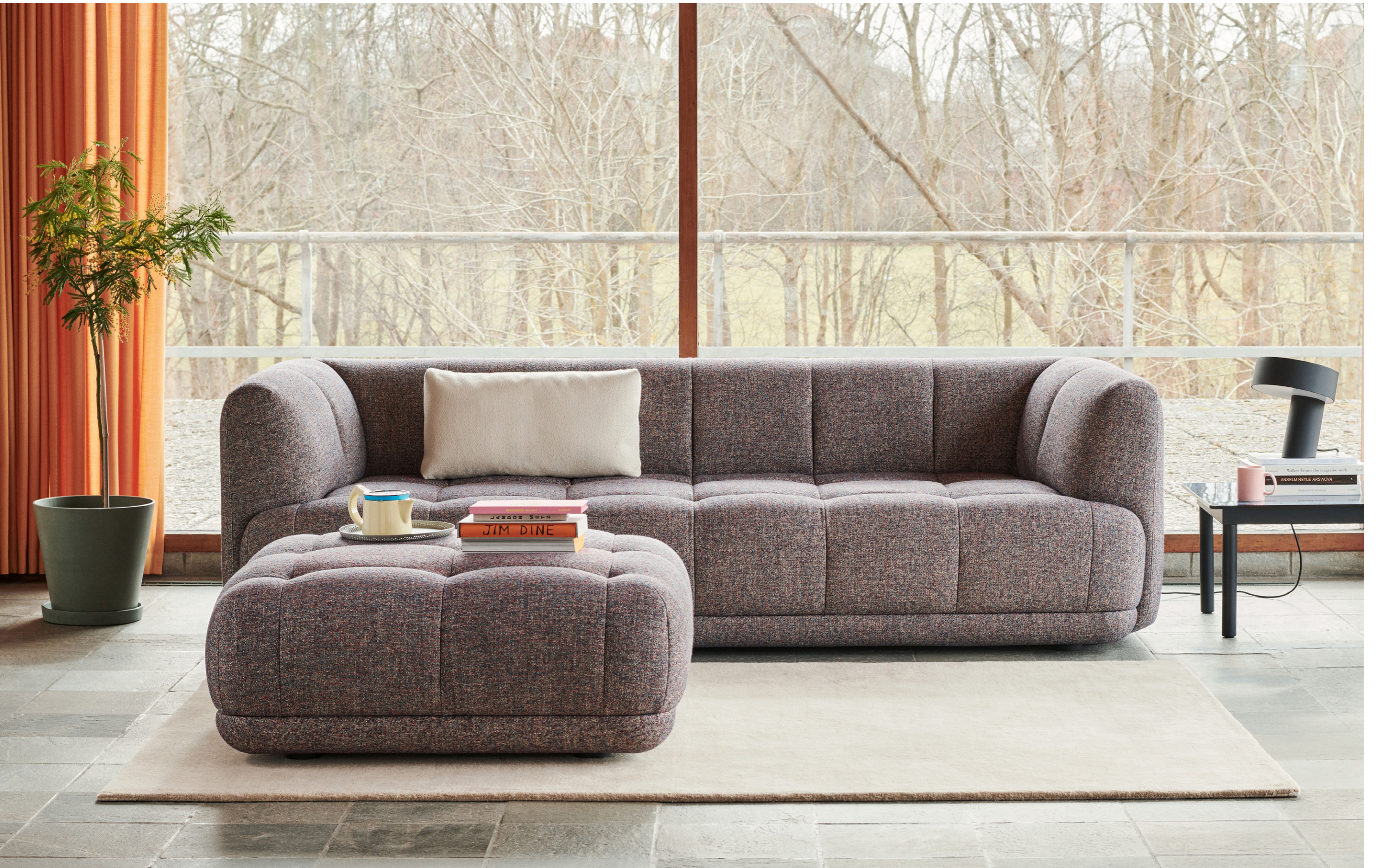
Quilton 3 Seater & Ottoman, Swarm Multi colour