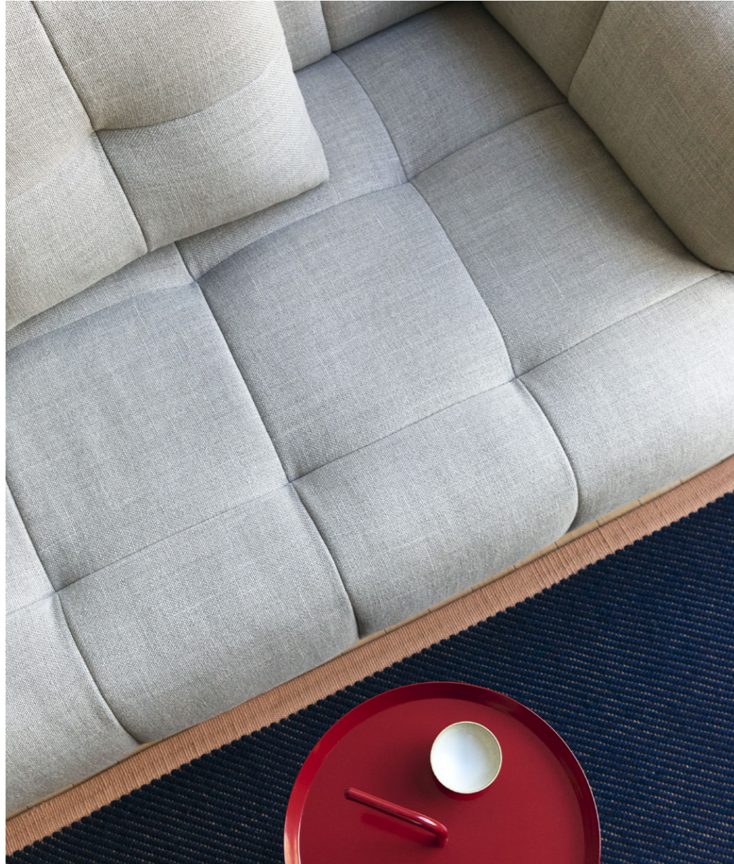
Quilton, Linen Grid Adriatic blue