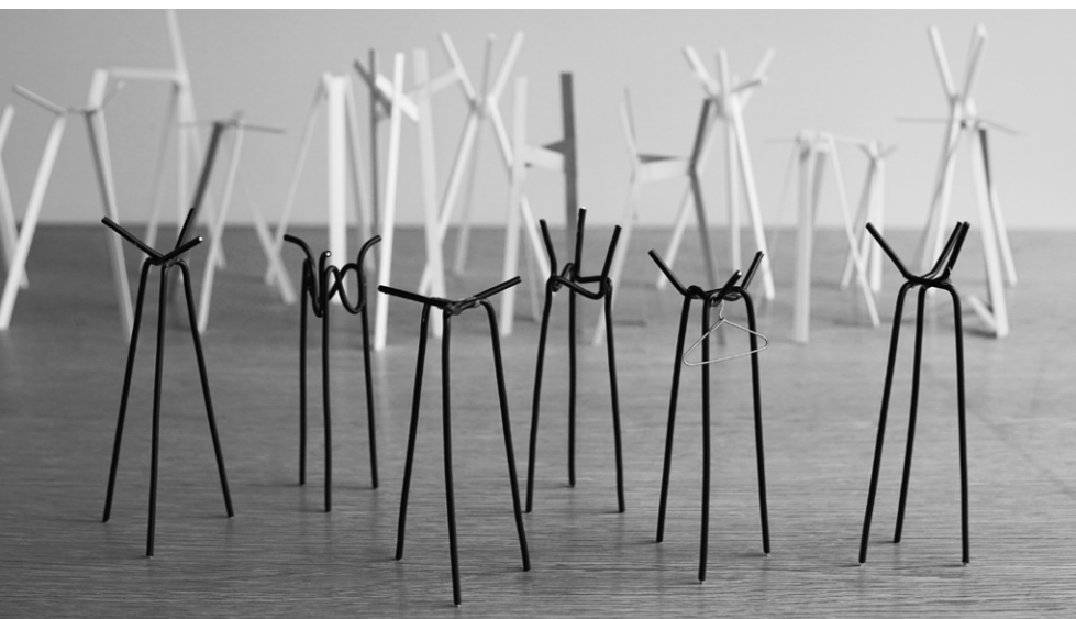
The unique shape of the structure is the feature of the design.