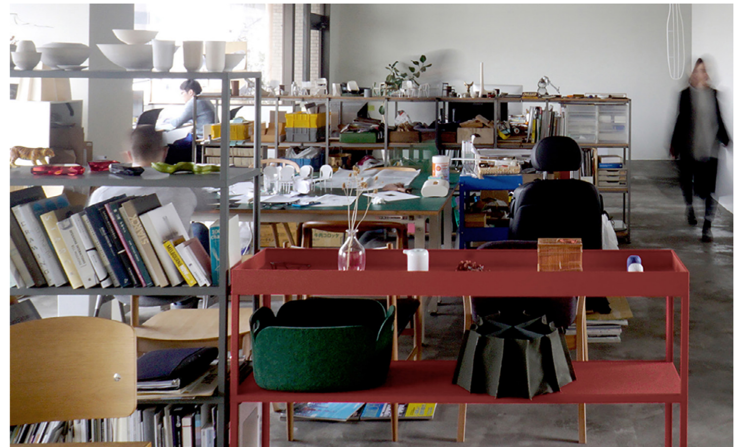
Jin Kuramoto's design studio in Tokyo, Japan.