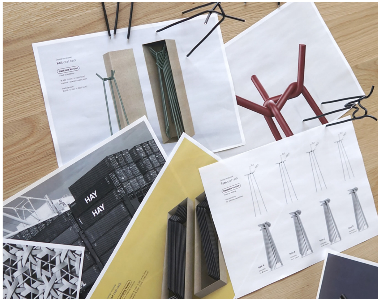
Jin's design process considered delivery and transportation when developing Knit.