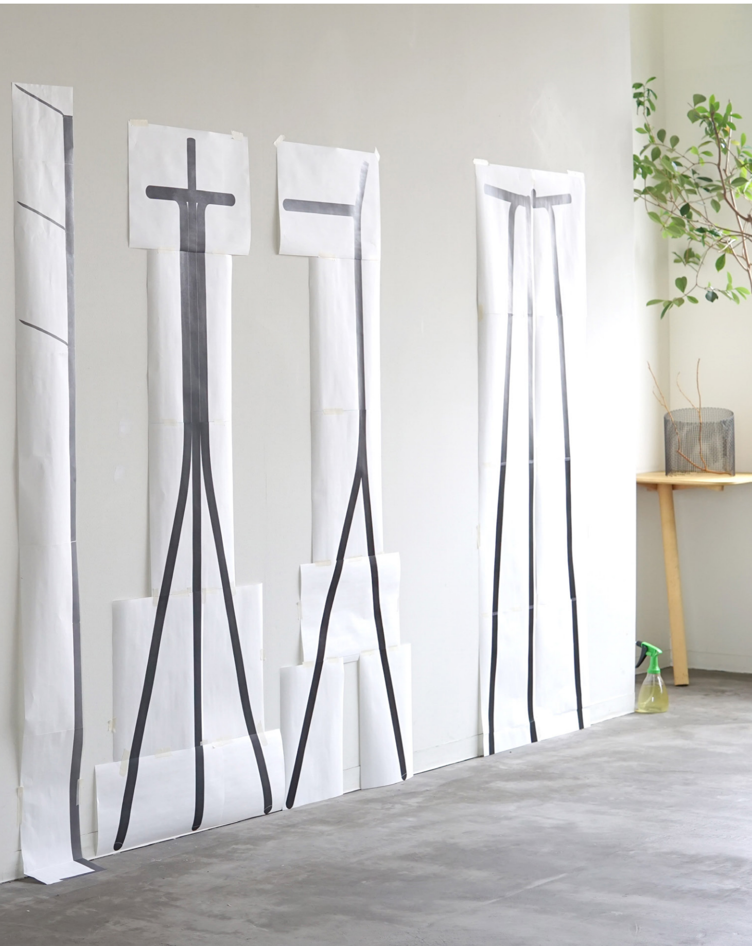
The three metal pipes are connected in a three-dimensional way so that they support each other.