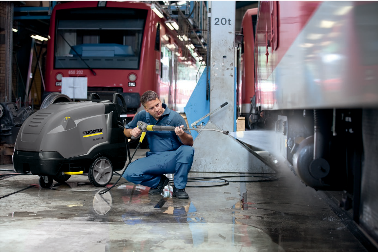
HDS-E 8/16-4 M 24kW